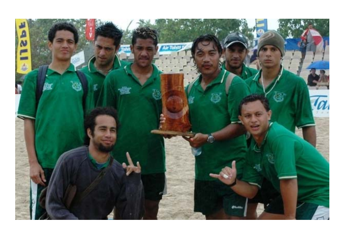
Cook Islands Fairplay Trophy