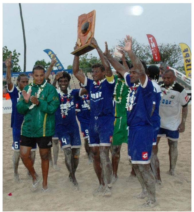
Solomon Islands 2006 OFC Beach Soccer Champions