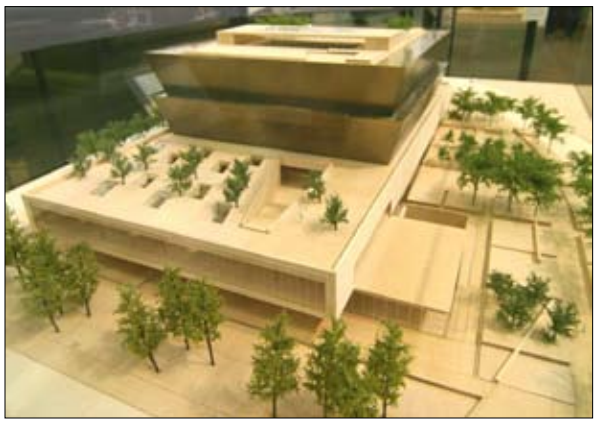
Design concept model for the National Museum of African American History and Culture submitted by Freelon Adjaye Bond / SmithGroup

In response to a 2007 invitation by the Smithsonian Institution to participate in consultation for the NMAAHC, the Advisory Council on Historic Preservation (ACHP) notified Acting Secretary Cristián Samper that it would participate in consultation. The ACHP's letter of June 6, 2007, cited the Criteria for Council Involvement in Reviewing Individual Section 106 Cases, and noted, "the project may include adverse effects on properties of national significance and unusual importance, notably the Washington Monument and the National Mall." Prior involvement in the NMAAHC