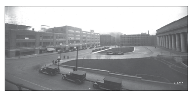
One of the stations for the Central Corridor Light Rail Project between Minneapolis and St. Paul will be located at the St. Paul Union Depot, in the Lowertown Historic District. One stipulation of the FTA's Programmatic Agreement for the project addresses the integration of the new station design into the Beaux-Arts landscape of the depot approach. This photo shows the area shortly after completion of the depot in 1923.

The potential for noise and physical damage from vibration posed a particular concern for consulting parties, including two historic churches located along the LRT route. Through consultation, FTA and the