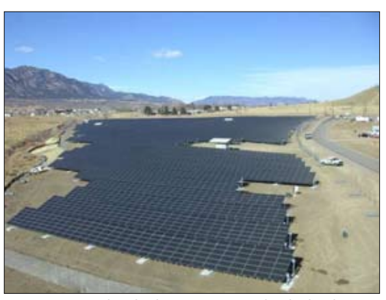
At Fort Carson, Colorado, the Army partnered with a local energy provider to do an enhanced-use lease. While not a BLM project, this photograph illustrates the scale of solar development even at this relatively small site and the potential for effects to historic properties. (photo courtesy U.S. Army).

However, creating a megawatt of solar energy currently requires a minimum of five acres of land, so one 250-megawatt power project would require at least 1,250 acres. Site preparation generally involves grading land