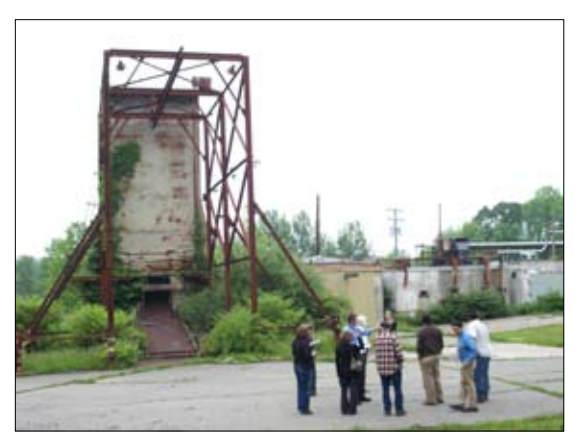
Consultation at Picatinny Arsenal

Since its founding, Picatinny Arsenal has seen numerous tenants, missions, and needs making for an intricate and overlapping historic tapestry that is a testament to the military's advancement of weapons and munitions. As missions ended and/or changed, the buildings and structures that were built to support those mission-specific needs remained with no certain future use. The management of these historic properties is complex due to many operational constraints associated with restricted access areas, explosive safety arcs, high noise zones, unexploded ordnance areas, and various other environmental factors. Many of the planned missions coming to Picatinny Arsenal over the next several years are unable to reuse these obsolete buildings