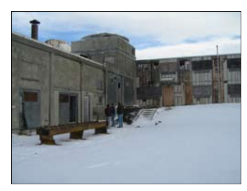
Battery Building at Site Summit

While the Programmatic Agreement (PA) is in final draft form, the Army is proposing to develop a Retained Buildings and Structures Treatment Plan to