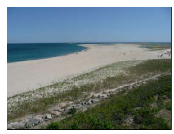
Chatham Beach, Cape Cod

In February 2005, the U.S. Army Corps of Engineers (Corps) issued an adverse effect determination for 16 historic properties including two National Historic Landmarks (NHLs): the Nantucket Historic District NHL and the Kennedy Compound NHL. The Advisory Council on Historic Preservation (ACHP) formally entered the consultation in March 2005. In August 2005, MMS assumed lead federal agency