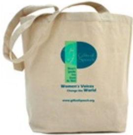
Tote Bag $12.99