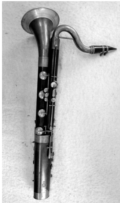
Figure 1. A bass clarinet by Ludwig and Martinka of Prague. Czech Museum of Music, E.135. Originally labeled as a bass in A, acoustic calculations showed this instrument to be pitched in C (see text). With kind permission of the Czech Museum of Music.

The development of the bass clarinet up to 1860 has been discussed comprehensively by Rice 4 . Two early forms, the 'plank' type and the visually striking 'serpent' form by Papalini did not lead to established production of instruments and were evolutionary dead-ends. The bass clarinet proper began in 1793 with Heinrich Grenser of Dresden who invented an instrument 5 in bassoon form, with wider bore and hence more powerful tone, descending to low C. The instrument survives and is now in Stockholm (S-Stockholm M2653), and it inspired a large number of instruments by many makers over at least 60 years. It evolved into the half-bassoon type (with a straight upper joint, a butt joint and a bell coming directly off this) towards the end of its life, and also into a simple folded tube (the Glicibarifono ), especially in Italy. An example by Ludwig and Martinka of Prague is shown in Figure 1. Without exception these instruments descended at least as low as written C.