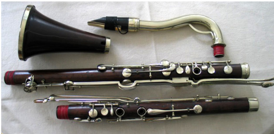
Figure 2: The Stengel bass (no. 5 in the above list), probably the earliest bass clarinet in A that is known.