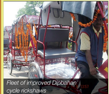
Fleet of improved Dipbahan cycle rickshaws