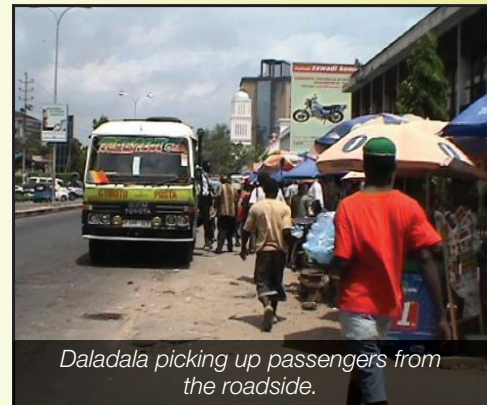
Daladala picking up passengers from the roadside.