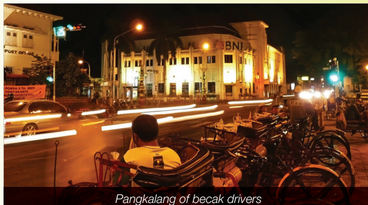
Pangkalang of becak drivers

The complementary nature of these modes helps in filling the gap left by the formal public transport systems. The informal modes typically do not compete with the formal system but rather serve the areas unserved