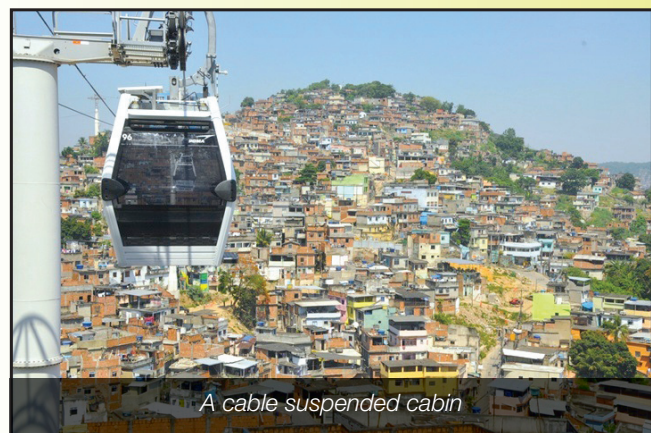
A cable suspended cabin