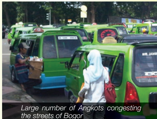
Large number of Angkots congesting the streets of Bogor

There are more than 8,000 Angkot vehicles that are licensed to operate in Bogor. A large number of Angkot vehicles lead to competition amongst the drivers to increase their patronage and thus the revenue. The patronage of Angkots has been reducing over time as people prefer to travel by private vehicles, especially motorcycles, as they are faster and more convenient. Also, the Angkot vehicles with low roof and door height make it difficult for the passengers to alight and board the vehicle, thus leading to discomfort. The inappropriate design of Angkot vehicle has also contributed in reducing its popularity. As a result of the declining patronage of Angkots, the drivers have resorted to unsafe driving practices, which lead to congestion and safety problems. To increase the patronage, the Angkot drivers are either too slow to pick up passengers or they drive too fast to overtake the leading