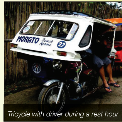
Tricycle with driver during a rest hour