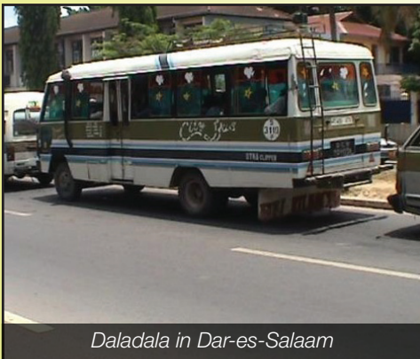
Daladala in Dar-es-Salaam

The city is attempting to integrate the existing informal public transport system with the proposed DART system. However, the city government is facing several challenges in involving the daladala operators in the integration