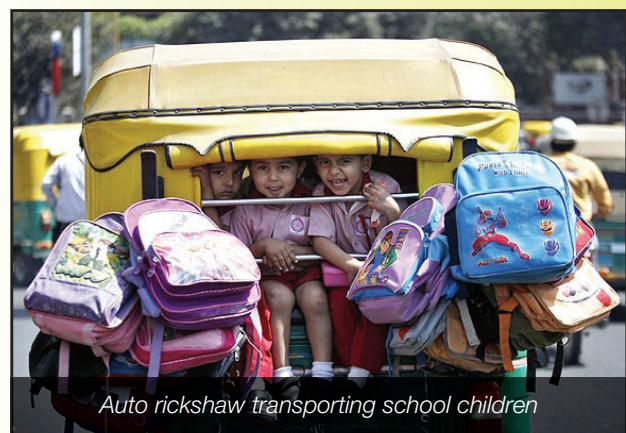
Auto rickshaw transporting school children