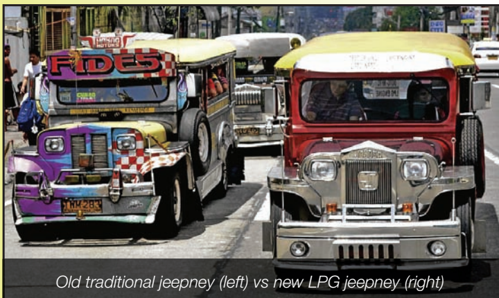
Old traditional jeepney (left) vs new LPG jeepney (right)

Since its origin, the government has made numerous regulations to organize and improve this basic mode of transportation in Philippines. Today, the drivers require special licenses, charge fixed fares, and operate on fixed routes unlike earlier when the drivers could pick up passengers from anywhere along the way and follow any route. The route followed along with the origin and destination is boldly demarcated along the sides of the Jeepneys on the exterior. Also proper areas have been identified for loading/