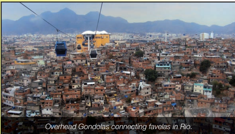
Overhead Gondolas connecting favelas in Rio.

Gondolas are systems equipped with cabins moving along on a unidirectional loop. The gondola cabins are small, with each commonly able to accommodate between 4 and 40 people. Systems of this kind generally have a declutching mechanism, which allows one car to be slowed or stopped in a station without any impact on the overall flow of cabins on the loop. One of the advantages of these systems is that they operate within their own dedicated space, and are therefore independent