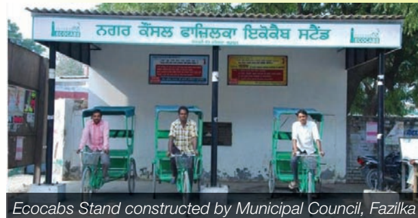
Ecocabs Stand constructed by Municipal Council, Fazilka