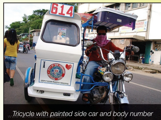
Tricycle with painted side car and body number