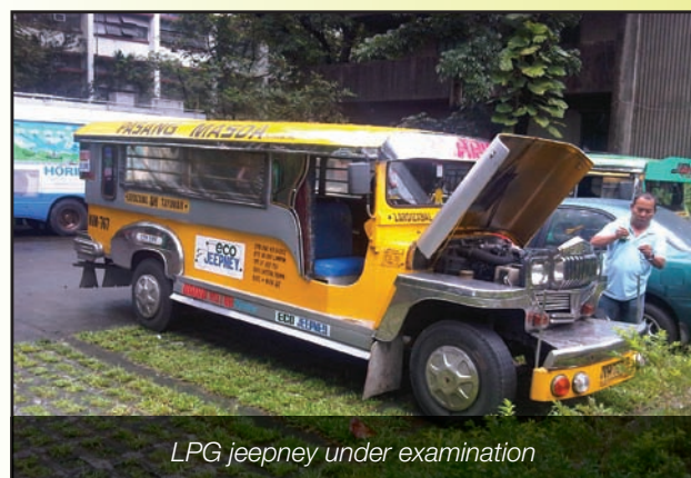
LPG jeepney under examination