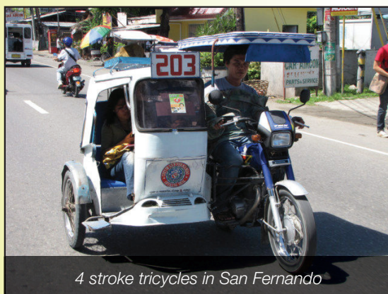
4 stroke tricycles in San Fernando

San Fernando City is the capital for Region I in Philippines, also known as the Ilocos Region. San Fernando City has been a major centre of trade and commerce in the area. It hosts a small airport and a commercial sea port, along with numerous business establishments to rival those found in any regional centre. San Fernando belongs to the first generation of City Development Strategy (CDS) implementers. The strategy focuses on the city's liveability, competitiveness, bankability, and good governance, and