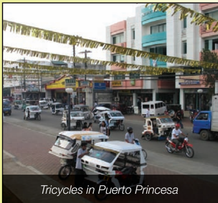
Tricycles in Puerto Princesa