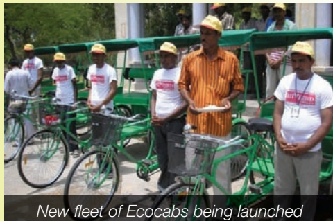
New fleet of Ecocabs being launched

“Ecocabs’ is the name given to the traditional Indian cycle rickshaw operations after adding to it facilities like dial-a-rickshaw.” 1 These are cycle rickshaw services made available on phone call at one’s door step through a network of call centres, similar to dial-a-cab/taxi service. Introduced in a town, Fazilka located in the state of Punjab, India, the scheme is a first of its kind in the country as well as in the world. Aimed at improving the unorganized cycle rickshaw transport system in the town and providing affordable means of mobility to the city residents, the scheme has been a success in the city and earned accolades, both nationally and internationally.