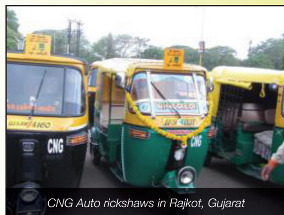
CNG Auto rickshaws in Rajkot, Gujarat