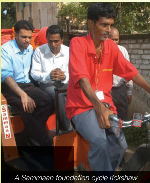
A Sammaan foundation cycle rickshaw

In 2007, Mr Irfan Alam established the Sammaan Foundation with the aim to organize the cycle rickshaw industry. The foundation follows an innovative business model. The underlying idea behind this is that the cycle rickshaws being mobile have the potential to offer a higher market penetration to the corporate sector, in the cities and towns of India. Sammaan Foundation capitalized on this characteristic of the cycle rickshaw industry and successfully transformed it into a marketing instrument for corporates. The profits generated through the sale of advertising space on the cycle