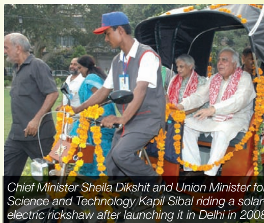
Chief Minister Sheila Dikshit and Union Minister for Science and Technology Kapil Sibal riding a solar-electric rickshaw after launching it in Delhi in 2008

The Soleckshaws can carry two passengers, a payload of 200 kg excluding the driver and run at an average speed of 15 km/h, which can go up to a maximum speed of 40 km/h. Typically, a fully-charged battery can run for about 70 km. When batteries run out, the solar-powered rickshaw drivers swap the exhausted cells for fully-charged ones at solar-powered charging stations. 4 The cost of recharging the battery is about INR 45 (less than US$1). 5 Battery