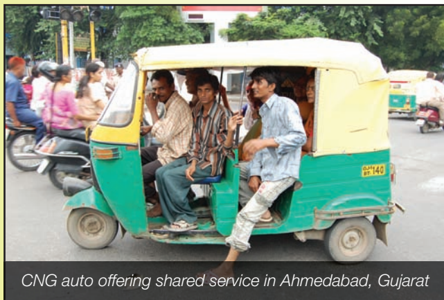
CNG auto offering shared service in Ahmedabad, Gujarat

Vehicle population in Ahmedabad comprises buses, auto rickshaws, private vehicles, etc. Among the various modes, auto rickshaws have been a vital mode of transport providing low-cost mobility options to the locals. The popularity of the mode among other modes of transport can be attributed to a number of reasons. Auto rickshaws provide affordable and comfortable door to door services to all sections of society. Auto services also operate on a shared basis within the city (the informal operations).