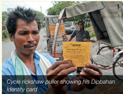
Cycle rickshaw puller showing his Dipbahan Identity card