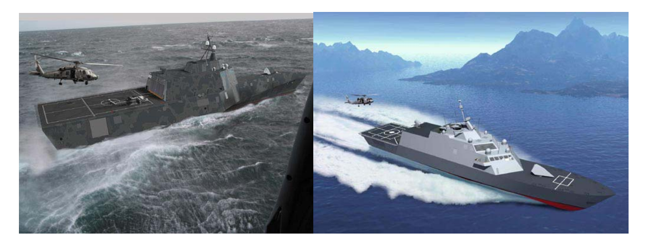
Figure 4: General Dynamics and Lockheed Martin LCS

The Navy is in the process of revolutionizing the Fleet. Leading that revolution will be the Littoral Combat Ship (LCS), which is specifically designed with a shallow draft and for operations with UAV's. This fast-paced program will see two ships in operation by 2008. As a pre-cursor to the LCS, the Navy is building a Littoral Surface Craft-Experimental (X-Craft), christened Sea Fighter (FSF 1) to evaluate the hydrodynamic performance, structural behavior, mission flexibility, and propulsion system of high-speed vessels and test a variety of technologies, which will allow the Navy to operate more effectively in littoral or near-shore waters. The DDX destroyer will be a revolutionary design that will be significantly different from current destroyers in both internal systems and external configuration.