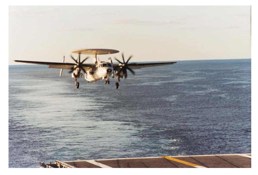
Figure 2: E-2C Hawkeye 2000 Conducting Tests aboard the USS JOHN F KENNEDY (CV67)

Currently, much of our ship suitability testing for air platforms is focused on modifications to current Fleet aircraft. In the fixed-wing area, much of our testing is concentrated on catapult launch and arrested landing structural tests (also called Shake, Rattle, and Roll Tests) of new or modified aircraft hardware, weapons, and avionics on all carrier-based platforms ranging from the F/A-18 Hornets/Super Hornets to the E-2C Hawkeye. Shake, Rattle, and Roll tests incorporate a series of shore-based catapult launches and arrested landings at the edges of the structural envelope to ensure structural compatibility of the test item in the shipboard environment. Recent examples of more complex testing include the shipboard lateral asymmetry envelope expansion test for the F/A-18E/F Super Hornet to give the Fleet additional flexibility in weapons loads and the shore-based and shipboard evaluation of the E-2C NP2000, which incorporates the new 8-bladed propeller (Figure 2). This same NP2000 propeller configuration will soon be tested on the C-2 Greyhound.