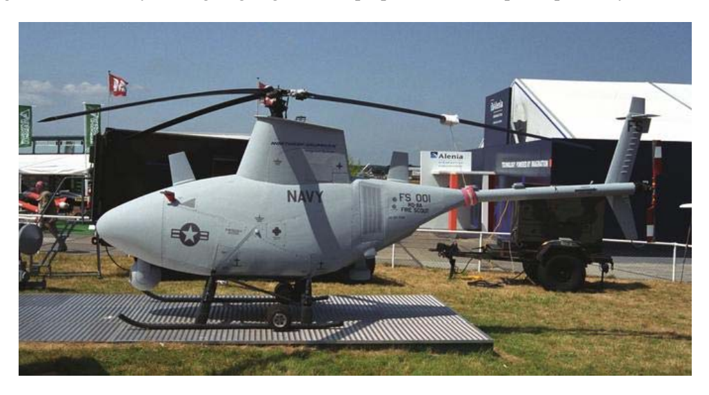
Figure 7: RQ-8 Firescout Vertical Takeoff UAV

Small UAV's are becoming more prevalent aboard ships. These air vehicles are being developed to both augment and/or replace manned aircraft. These UAV's use many unique forms of launch and recovery techniques, including pneumatic and bungee catapults, bungee style arresting gear, capture nets, and harpoon-type holddowns. Additionally, UAV's have a variety of methods of control systems for launch and recovery from fully automated to manually controlled systems. The RQ-8 Firescout Vertical Takeoff UAV (VTUAV) shown in Figure 7 is currently undergoing flight test in preparation for ship compatibility tests.