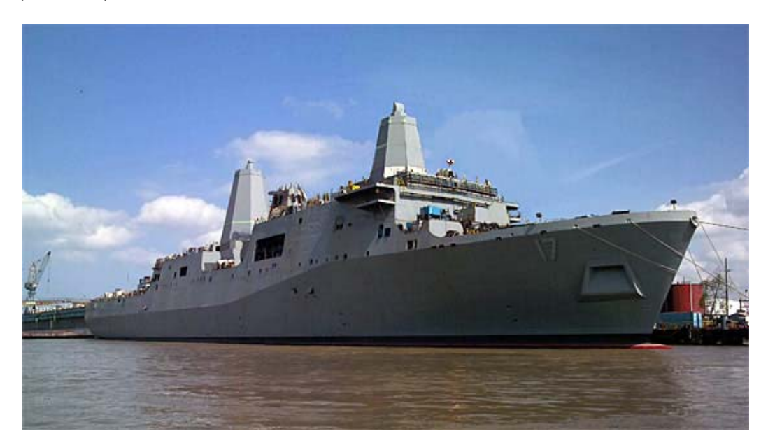
Figure 5: USS San Antonio (LPD 17)

The LDP 17 multi-mission San Antonio class ships (Figure 5) will be the first ships designed to accommodate the tilt-rotor MV-22 Osprey aircraft, the advanced amphibious assault vehicle (AAAV), and the landing craft air cushion (LCAC). LPD 17 aircraft compatibility testing will commence this summer using conventional helicopters, the V-22, and the AV-8B.