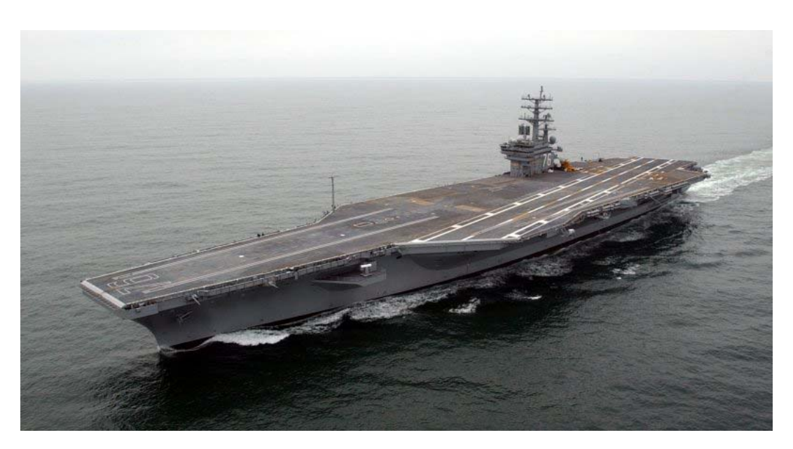
Figure 6: USS RONALD REAGAN (CVN 76)