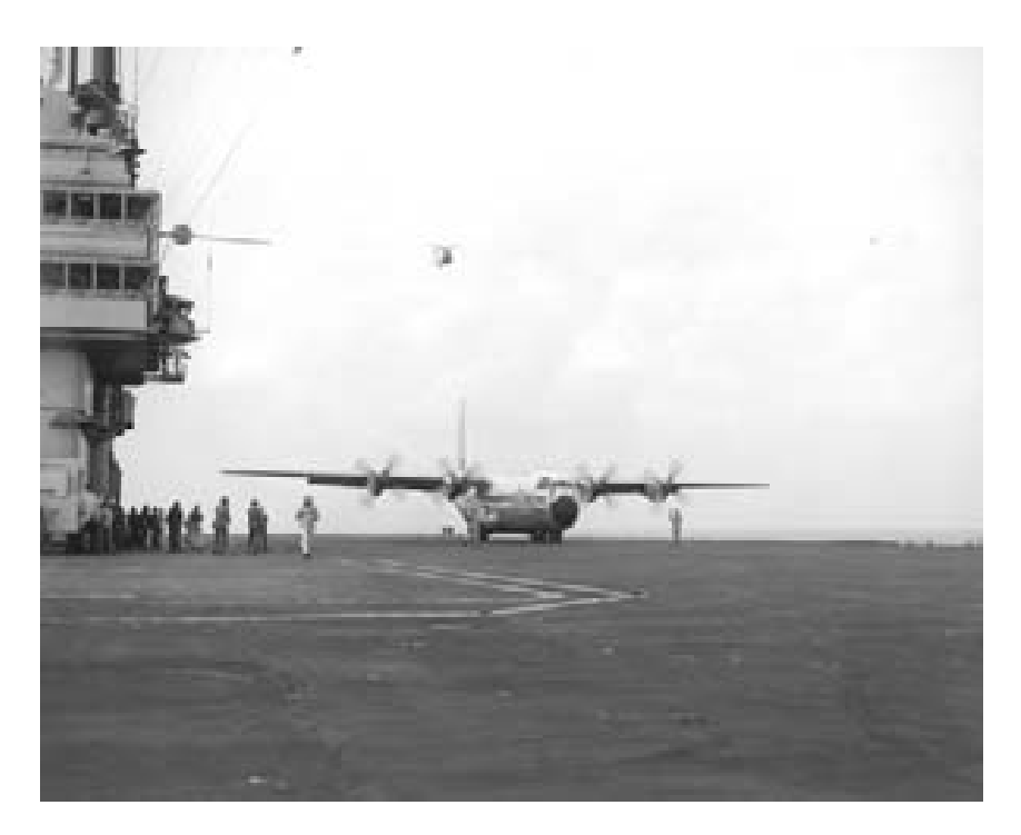
Figure 8: C-130 Landing aboard the USS FORRESTAL (CV 59), 1963

As described above, we must develop new and innovative methods for testing future capability. However, we are also challenged in our need to learn from testing conducted in the past. We have seen a significant turnover in personnel since the last time we conducted sea trials with a STOVL aircraft. With upcoming AV-8B testing on LPD-17 and testing of the new JSF F-35B STOVL, we will research and understand the test techniques utilized during AV-8B testing last conducted in the 1980's. Additionally, we will be required to demonstrate ski-jump capability on the JSF F-35B. Much of our expertise in conducting ski jump testing has diminished over time. Going back even further in time, we were asked to evaluate the possibilities of landing C-130-sized aircraft on carrier-sized flight decks in support of design trade studies for the MPF(F) program. The C-130 was evaluated aboard the USS FORRESTAL (CV59) in 1963 (Figure 8). Information provided in the test reports and contact with the testers was used to help us examine ship suitability issues for the latest design considerations.