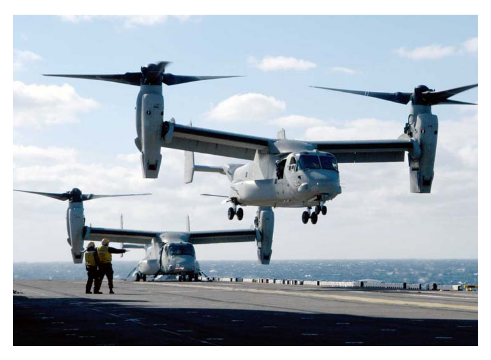
Figure 3: V-22 Conducting Interaction Tests Aboard the USS WASP (LHD 1)

In the rotary-wing area, much of our current testing is concentrated on testing highly modified versions of current aircraft. The H-60R, H-60S, and UH-1Y/AH-1Z, are all modified versions of current Fleet aircraft undergoing ship suitability tests. Shipboard testing of the V-22 is ongoing as the team continues to expand shipboard launch and recovery bulletins and evaluate interaction with other aircraft (Figure 3). Upcoming tests include ship suitability tests of the new presidential helicopter (2008) and the new heavy-lift helicopter (2012). This branch will also be involved with interoperability testing of Army, Air Force, and Coast Guard helicopters on air-capable ships. Specific ship programs will be discussed later in this paper.