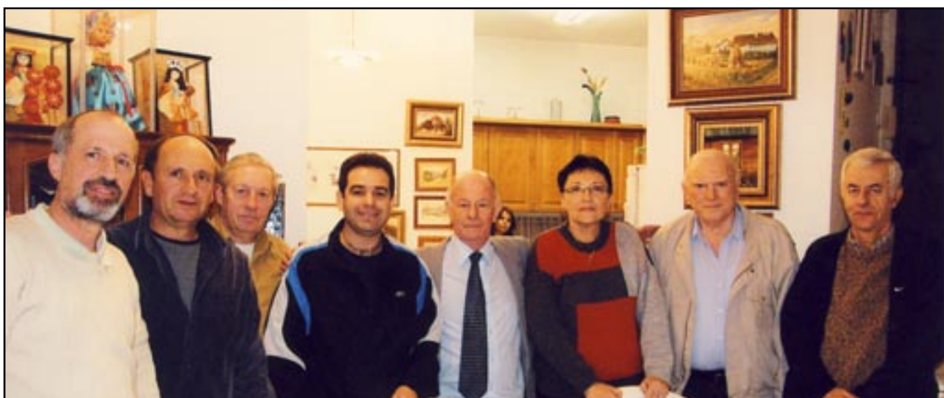
Israeli members during the S.C.I. meeting