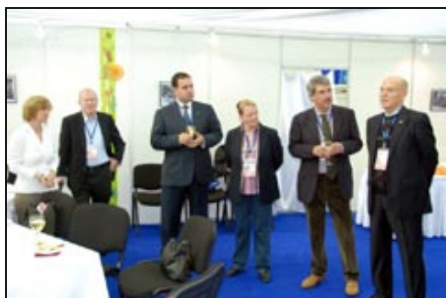
Swaythling Club Members "get together"

On the Opening Night of the European Championships in St. Petersburg last October, the Russian T.T. Federation took the opportunity to present to the spectators "CHAMPIONS OF THE PAST".