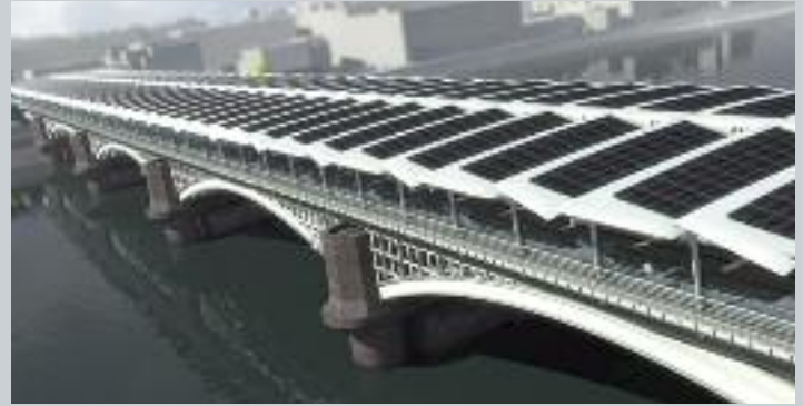
How Blackfriars Bridge with its solar panels should look in the middle of next year

The Blackfriars upgrade is part of the Thameslink programme.