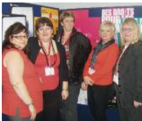
ASLEF women go international at ITF London conference

There is scope to invite employing FOCs and TOCs to comment on the survey, especially in areas such as facilities,