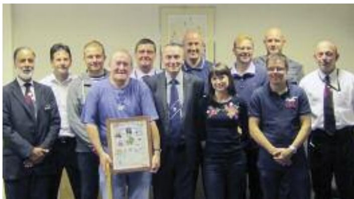
The Saltley stalwarts on show!