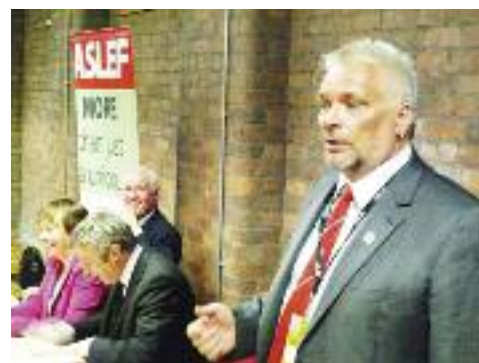
'Reduce dividends and profits – not staff costs!' is Tosh's formula