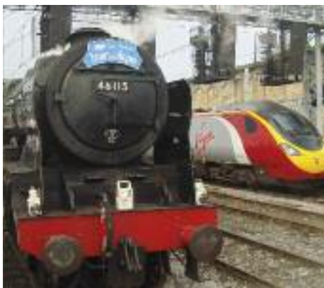
The Train of Hope gets ready to steam out, with its modern equivalent on the facing platform

Our fundraising target is to break £40,000. We are well on the way and there are still some very special items available for sale or auction on our website, including photographs of the day, an original oil painting, limited edition prints, programmes and more.