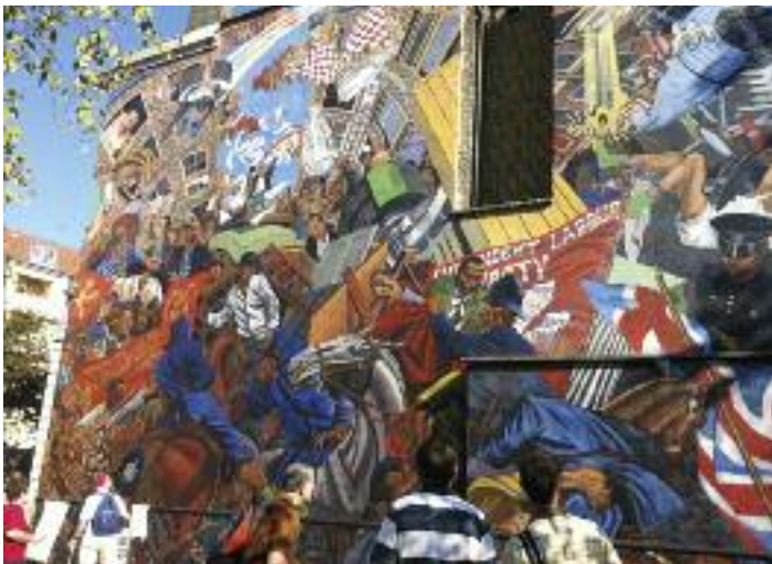
The splendid mural that is a memorial to the brave anti-fascist demonstrators of 1936

■ The Battle of Cable Street took place on Sunday 4 October 1936. Oswald Mosley, leader of the British Union of Fascists, planned to march thousands of his supporters, clad in their Blackshirt uniforms, through the East End of London as a provocation to the large Jewish population of the area.