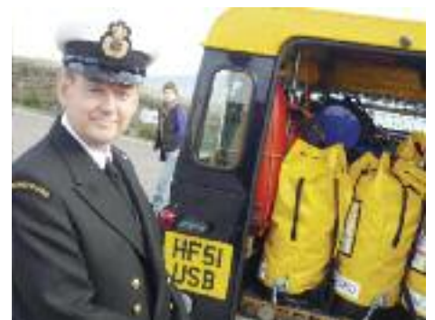
The well-stocked Coastguard vehicle is packed with stretchers, pegs, rope and other rescue equipment

The coastguard was set up 200 years ago to combat smuggling, but now Her Majesty's Coastguard is a government agency, which, like rail, comes under the Department for Transport.