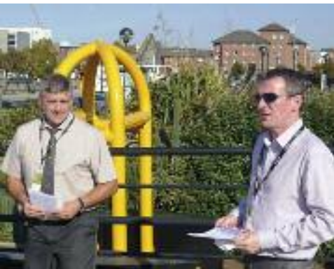
Enticing people to come to the ASLEF fringe – and yes, those blue skies are Liverpool a few days before October!