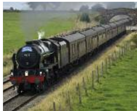
Hope in the country

Our fundraising target is to break £40,000. We are well on the way and there are still some very special items available for sale or auction on our website, including photographs of the day, an original oil painting, limited edition prints, programmes and more.