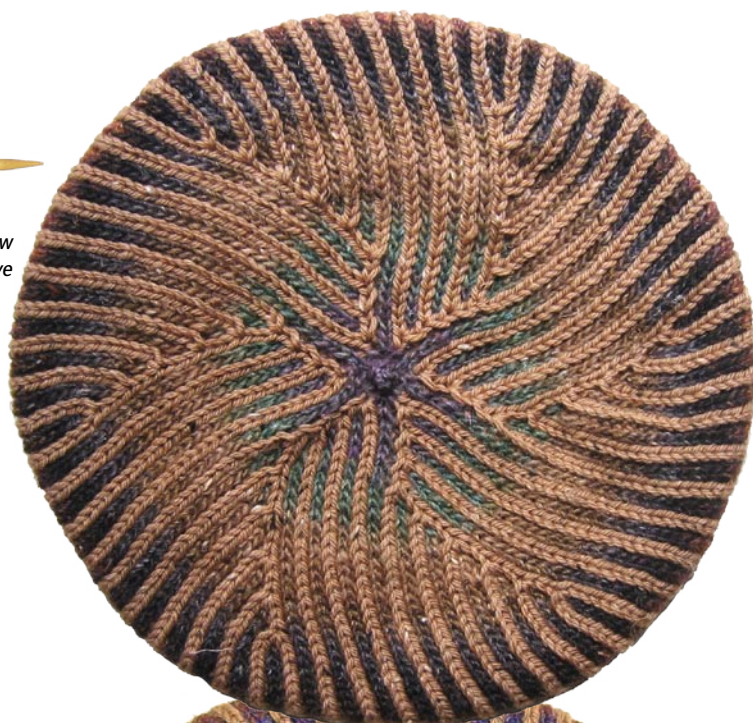
the view from above

If at some point you need to 'frog' then unravel and pick up the stitches onto a smaller circular needle. This will make the stitches easier to pick up and you can work off of this needle, onto your original needle, for one round.