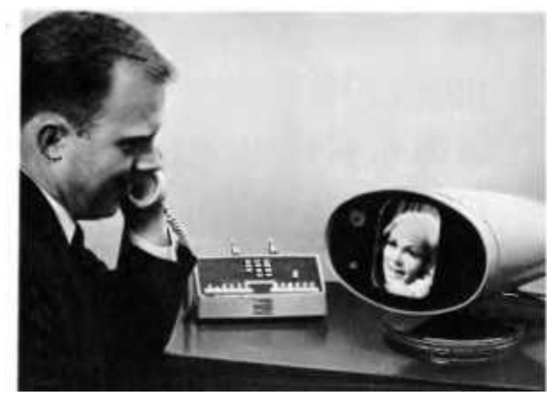
The ability to see facial expressions and gestures adds new effectiveness and a new dimension to telephone communications.

IN WASHINGTON, D.C., call the Picturephone attendant at the new National Geographic Society Building, 16th and L Sts., N.W., Area Code 202 392-8458.