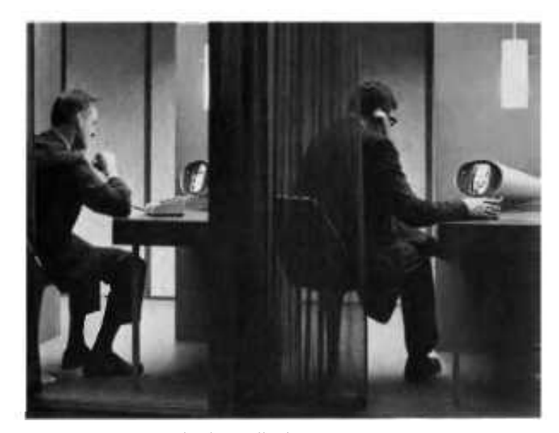
PICTUREPHONE service is on display in the Bell System Exhibit at the New York World's Fair and at Disneyland in California. Visitors may participate in special closed-circuit Picturephone demonstrations free of charge.

We are able today, however, to give some people the opportunity to use the service, and we're interested in their reaction. The three-city service is by no means the ultimate. There are many future possibilities for this service and we haven't as yet fully evaluated other applications or determined when they might be available. But we do expect that eventually this service will evolve for anyone who wants it— whether for businesses, schools, or homes.