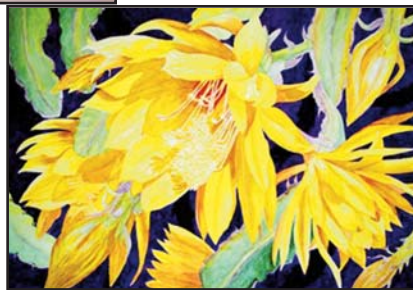
Painting by Lee Taiz

March 8 - 24th presents "Natural Beauties", All Media, Open to all Santa Cruz County Artists; $25 SCAL Members for up to 2 pieces (28" width max. each piece); $35 non-members for up to 2 pieces (28" width max. each). Three weekends to show, with our Reception Saturday, March 10th from 3 - 5PM.