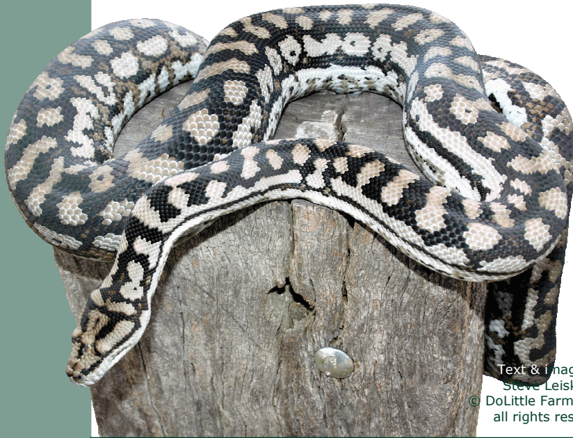
Text & Images by Steve Leisk BSc. © DoLittle Farm 2008 all rights reserved