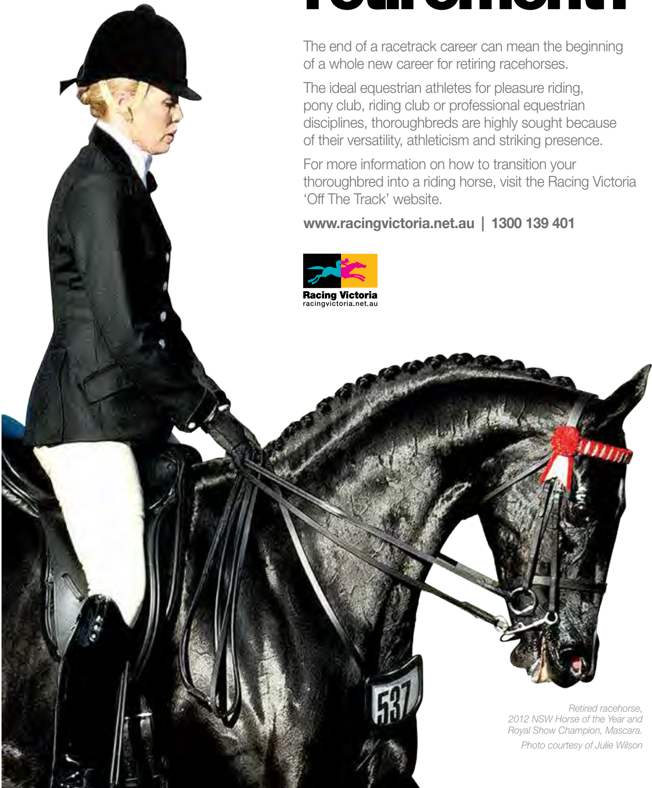
Retired racehorse, 2012 NSW Horse of the Year and Royal Show Champion, Mascara.