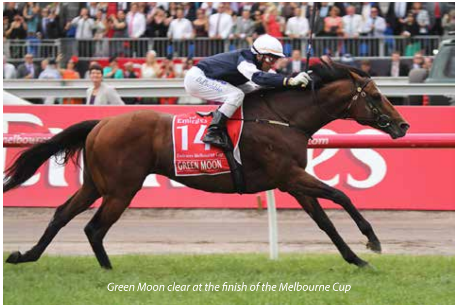
Green Moon clear at the finish of the Melbourne Cup

Melbourne Cup winner after Backwood (Bachelor's Double – Lady Of Grace, by St Frusquin) and Vintage Crop (Rousillon – Overplay, by Bustino) while Montjeu became the 17th Irish-bred stallion to sire a Melbourne Cup winner and sixth in the past 10 years.