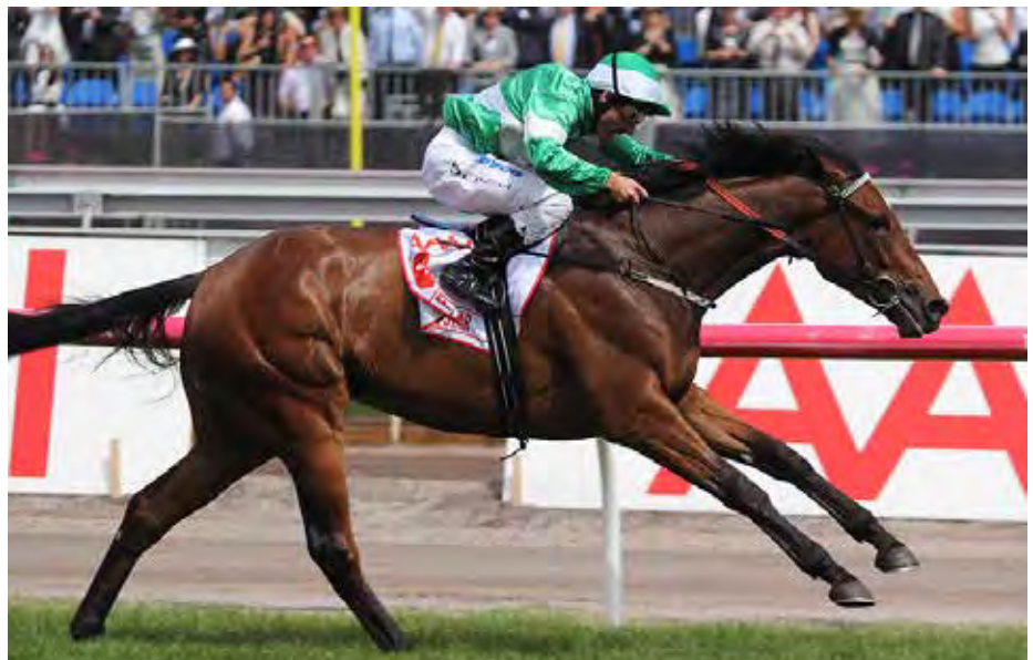
Classic victory: Fiveandahalfstar powers away with the VRC Derby

The unlucky Rawnaq (Redoute's Choice – Winning Belle, by Zabeel) flew home late to break up the Fastnet Rock contingent with his third after suffering interference at a vital