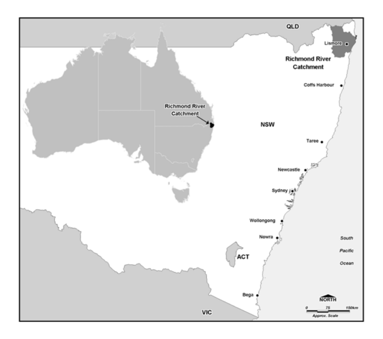
Figure 1 – Richmond River Locality Plan