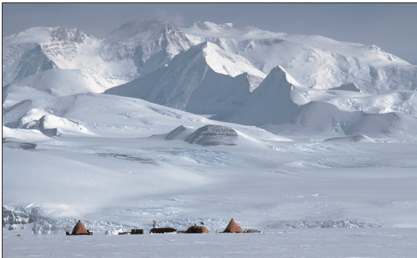
A glaciological field camp in the shadow of the Ellsworth Mountains, Ellsworth Land, Antarctica

British Antarctic Survey (BAS) , part of the UK Natural Environment Research Council, is a world leader in research into global issues in an Antarctic context. BAS is the UK's national Antarctic operator. It is based in Cambridge, England and carries out the majority of its research programme in Antarctica and the Southern Ocean. It employs over 400 staff and has an annual budget of ~£40 million, runs nine research programmes and operates five research stations, two Royal Research Ships and five aircraft in and around Antarctica.