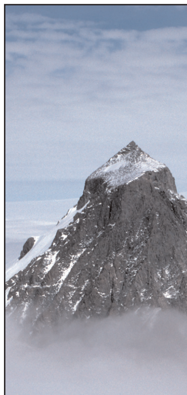
Nunatak on the Antarctic Peninsula

TOTAL 45,317km 100.00% Ice shelves 18,877km 42.00% Rock 5,468km 12.00% Ice coastline 20,972km 46.00%