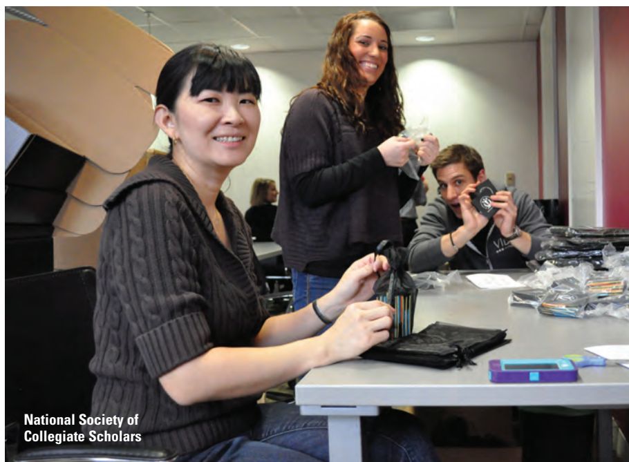
National Society of Collegiate Scholars

The organization lacks the glamour appeal of many nonprofits, such as Wounded Warrior Project, which naturally attracts certain types of workers who