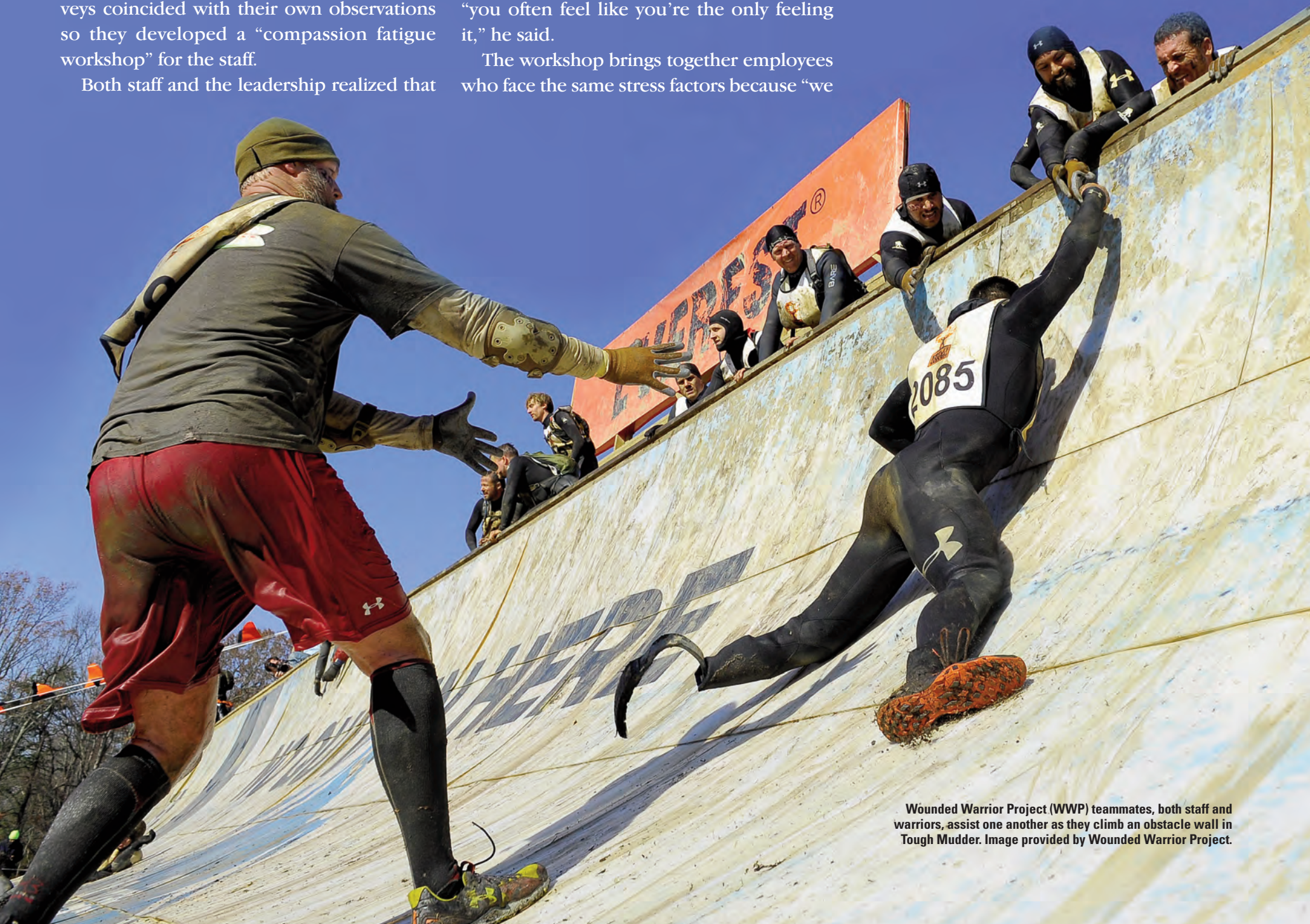
Wounded Warrior Project (WWP) teammates, both staff and warriors, assist one another as they climb an obstacle wall in Tough Mudder.