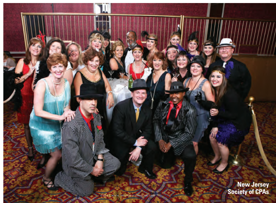
New Jersey Society of CPAs