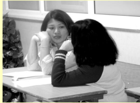
Faith Sharing & Spiritual Session