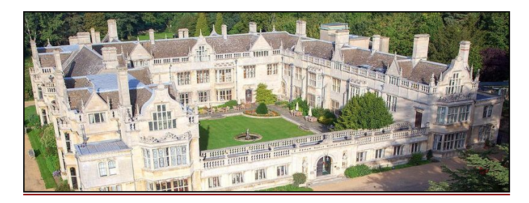
Rushton Hall now provides you with the chance to enjoy a short stay in a place truly steeped in history.