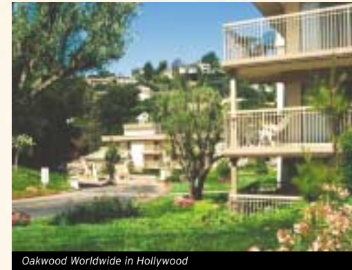
Oakwood Worldwide in Hollywood

The Academy now offers attractive housing options for students on both campuses through special arrangements with nearby services. In Hollywood, Oakwood Worldwide provides furnished apartments with many amenities, including a swimming pool and fitness center. In New York, The New Yorker, a hotel near campus offers 24-hour security, a fitness center, private bathrooms, as well as single or double occupancy rooms. A full description of these options plus many more are available on the Academy's website www.aada.org .