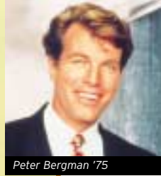
Peter Bergman '75