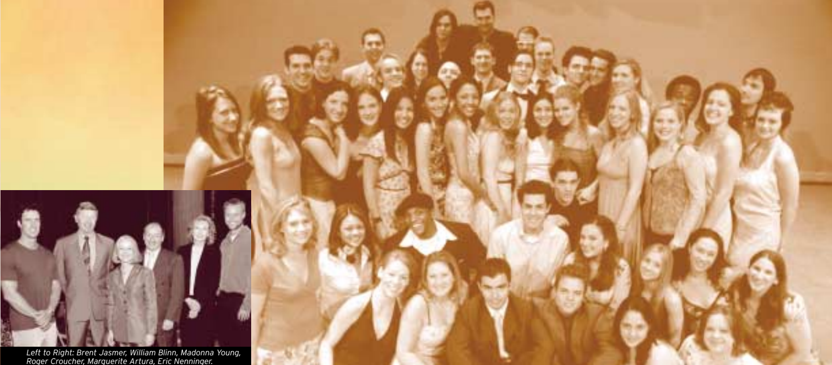
AADA Hollywood 2003 Graduating Class