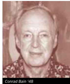
Conrad Bain '48