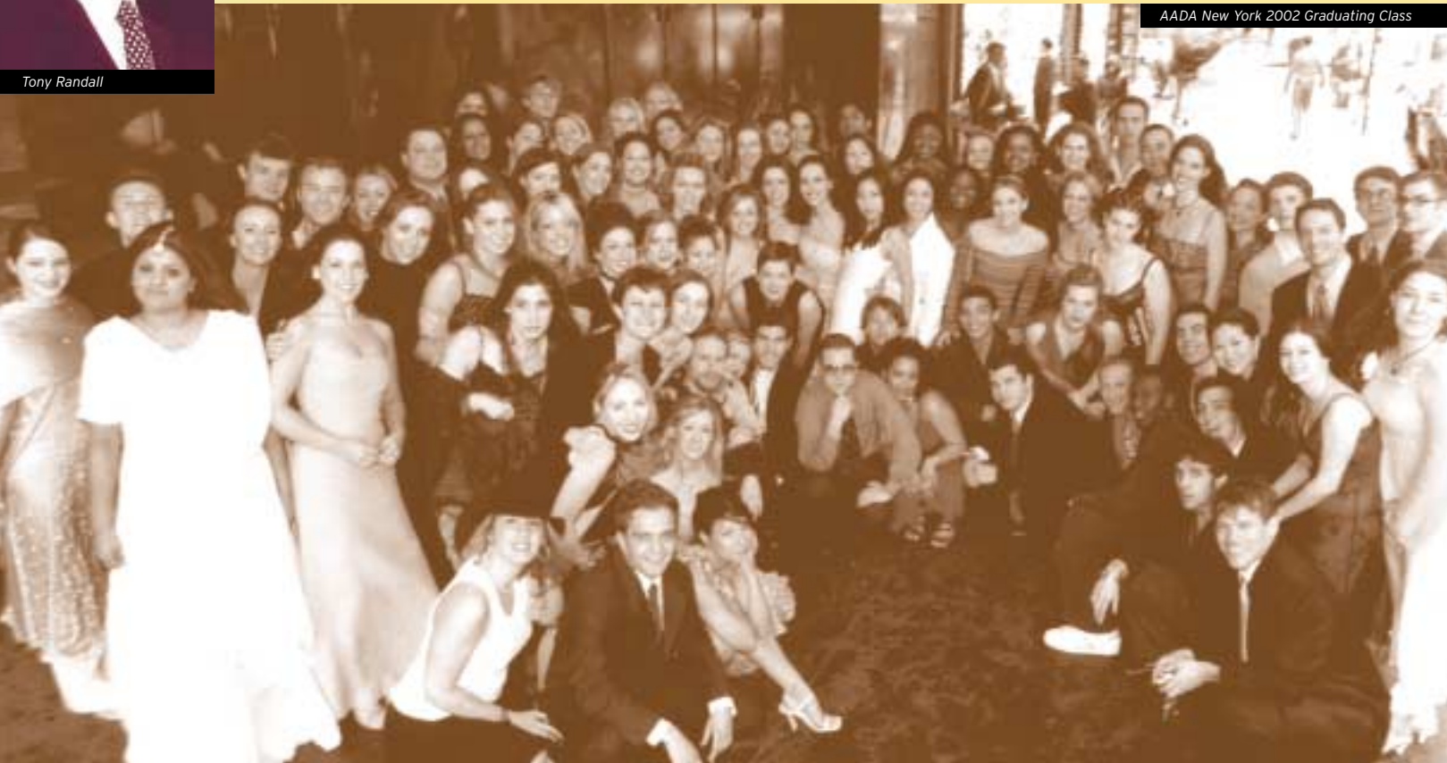
AADA New York 2002 Graduating Class