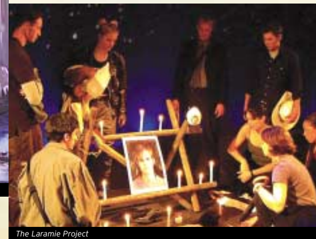
The Laramie Project