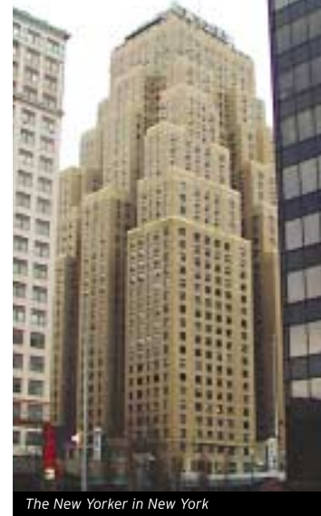
The New Yorker in New York

Alumni are welcome to attend Academy Company performances on both campuses, and notices of performance dates and ticket information are posted on our website at www.aada.org . On behalf of the Alumni Association, I urge you to keep in touch, let us know your e-mail address and your latest accomplishments. And, please support our alma mater to the best of your abilities.