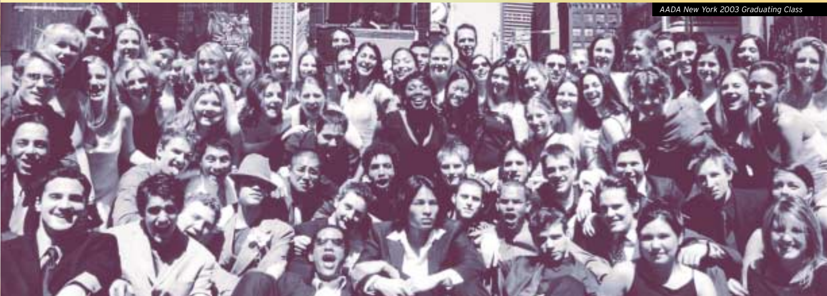
AADA New York 2003 Graduating Class