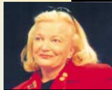
Gena Rowlands '53