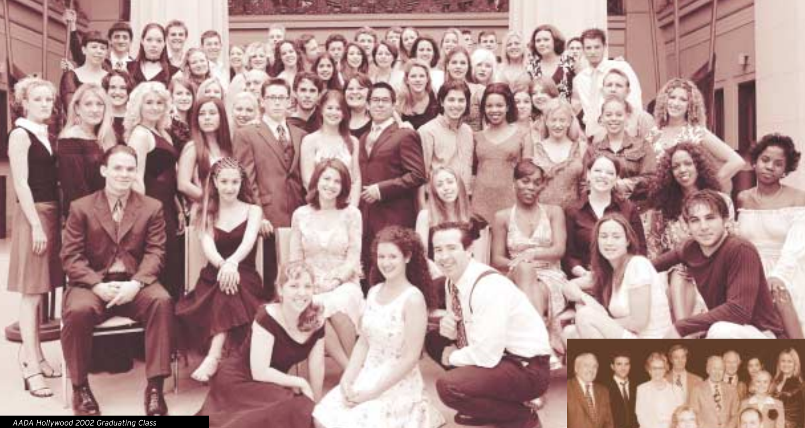
AADA Hollywood 2002 Graduating Class