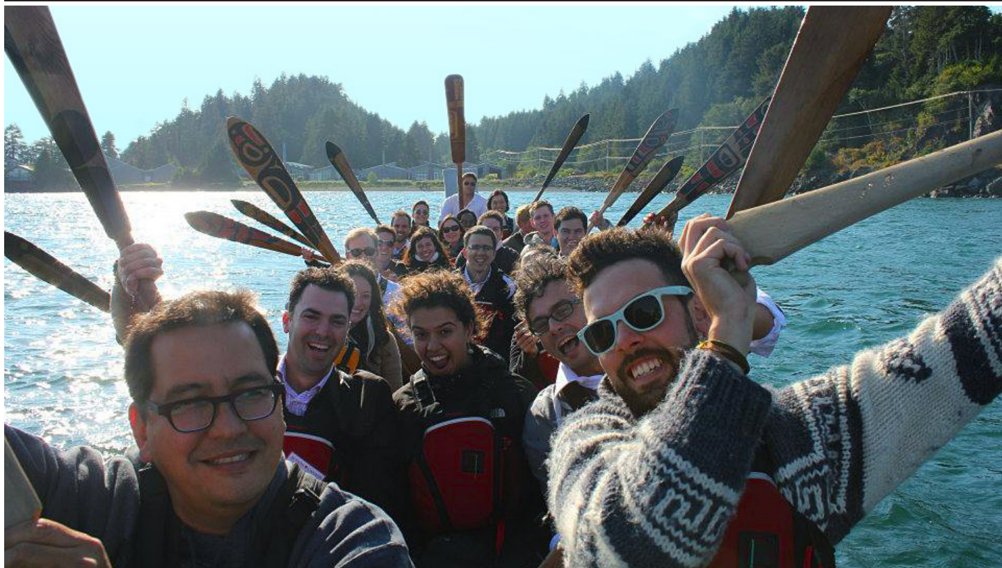
12 FELLOWS EXPLORE OUR HISTORY AND HERITAGE DURING THE HAIDA GWAI Conference