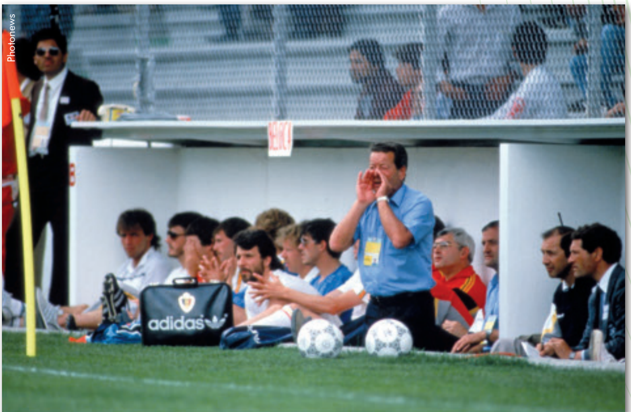
Guy Thys, head coach of Belgium during the 1986 FIFA World Cup in Mexico

Guy Thys (▼), the legendary Belgian coach, confirmed the harsh reality of football life when he stated: “Education is always indispensable, but the match still remains the ultimate examination.” So, it was time for our hero to stand alone, and José started coaching at SL Benfica (briefly) before moving to Uniao de Leira, a modest