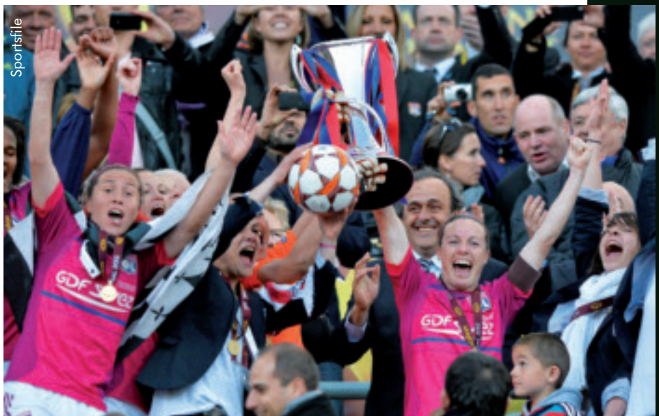
Olympique Lyonnais players hold aloft the UEFA Women's Champions League trophy, presented to them by the UEFA president, Michel Platini