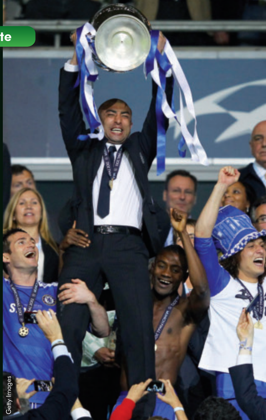
Roberto di Matteo and his players celebrate winning the UEFA Champions League trophy after their win against FC Bayern München