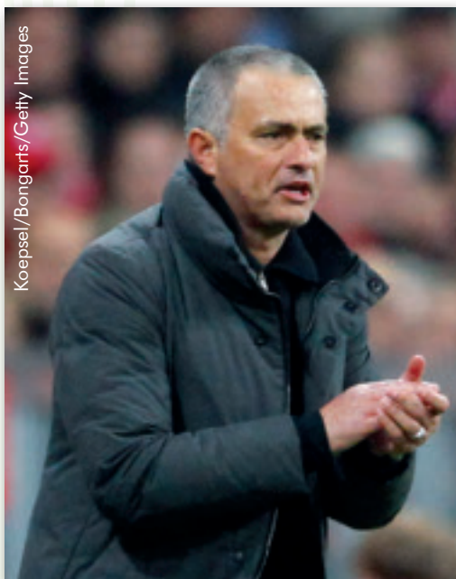
José Mourinho, now in charge of Real Madrid CF...

technicians José Mourinho, Sir Alex Ferguson and the others know football, but they also know about life – their training to reach the top of their profession has been, in José’s words, “fully comprehensive”. ●