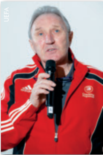
Howard Wilkinson, president of the League Managers Association in England

have had an average tenure of 0.85 years. However, the proportion of resignations has risen, whereas the number of dismissals has dropped. Of the 49 cases, 33 were dismissals and 16 resignations, with 9 of the latter motivated by a