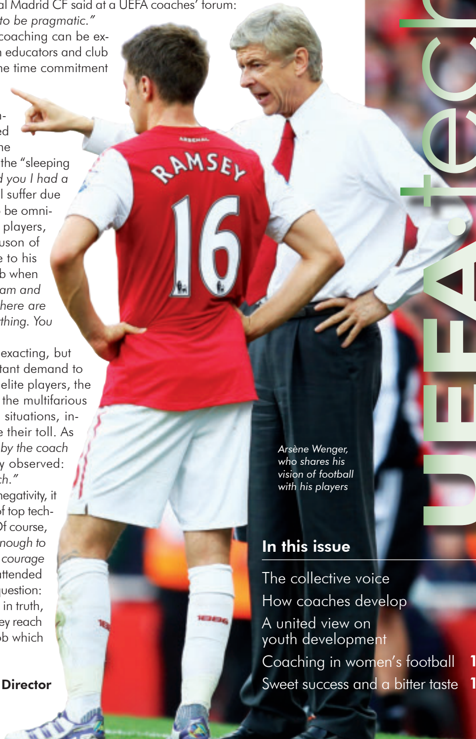
Arsène Wenger, who shares his vision of football with his players