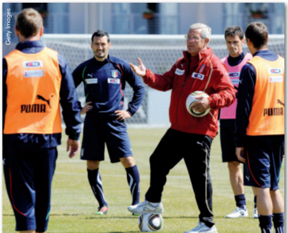
Marcello Lippi during a training session with the Italian national team

Firstly, he came from a football family – his father, Felix, was a professional player who later became a senior club coach. And it was in this environment that the young José became interested in scouting and coaching. He was also a player, although not in the professional ranks, and this raises the issue