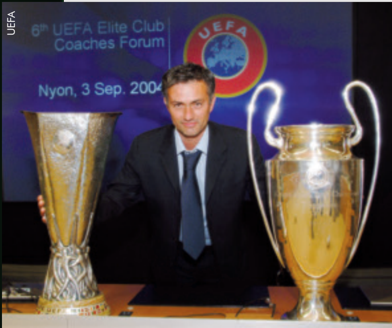
José Mourinho has won both major European club trophies, the UEFA Champions League and the UEFA Cup