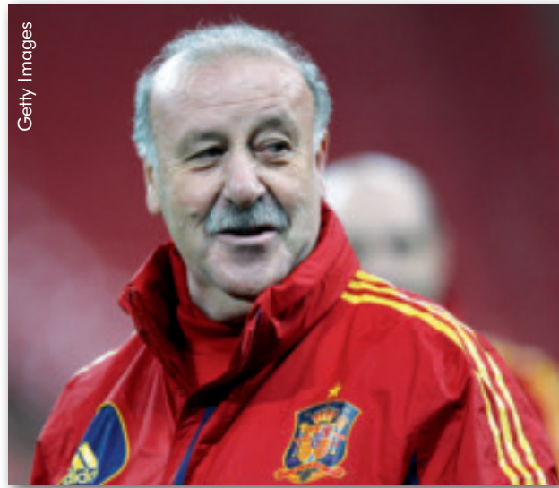
For Vicente del Bosque, a coach’s knowledge should go beyond just football

Vicente del Bosque (▼), Spain’s world champion coach, said at a UEFA coaches’ gathering: “If you only know football, you are lost.” Europe’s top coaches can easily relate to those words and to the sentiments of the jazz musician who once declared: “We play life.” Top