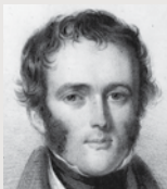
Sir Charles Lyell