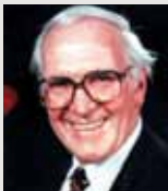
Sir James Black