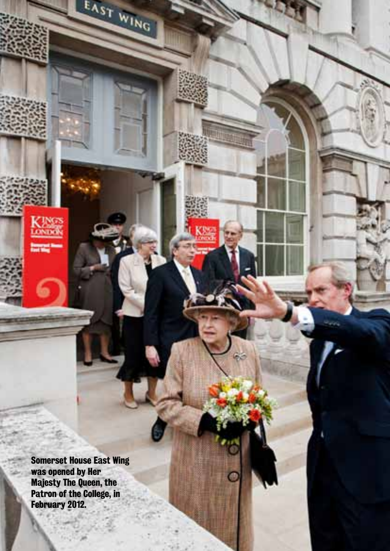
Somerset House East Wing was opened by Her Majesty The Queen, the Patron of the College, in February 2012.