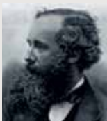
James Clerk Maxwell

KING'S COLLEGE LONDON and its constituent institutions have been associated with some of the greatest innovators of their time, including Sir Charles Lyell, founder of modern geology; Sir Charles Wheatstone, pioneer of current electricity and wireless telegraphy; John Frederic Daniell, inventor of the constant-cell battery; Thomas Hodgkin, Thomas Addison and Richard Bright: distinguished doctors who identified the important diseases that are named after them; FD Maurice, founder of the Working Men's College and campaigner for women's higher education; physicist James Clerk Maxwell, Einstein's predecessor in electromagnetism and relativity; Florence Nightingale; and Lord Lister, who established antiseptic surgery and is known as 'the father of modern medicine'. Among the many writers educated at King's were Romantic poet John Keats (once a medical student at Guy's), novelist Thomas Hardy, WS Gilbert of Gilbert and Sullivan fame, Virginia Woolf and Arthur C Clarke.