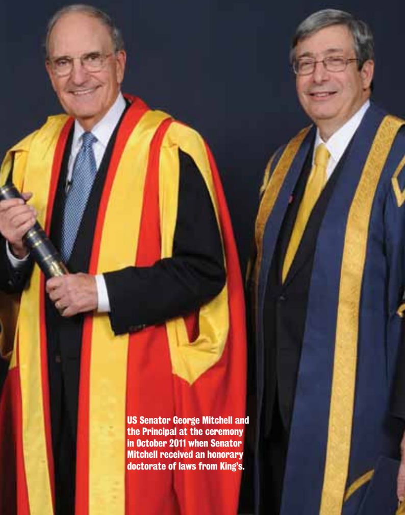
US Senator George Mitchell and the Principal at the ceremony in October 2011 when Senator Mitchell received an honorary doctorate of laws from King's.