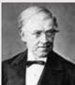
Sir Charles Wheatstone