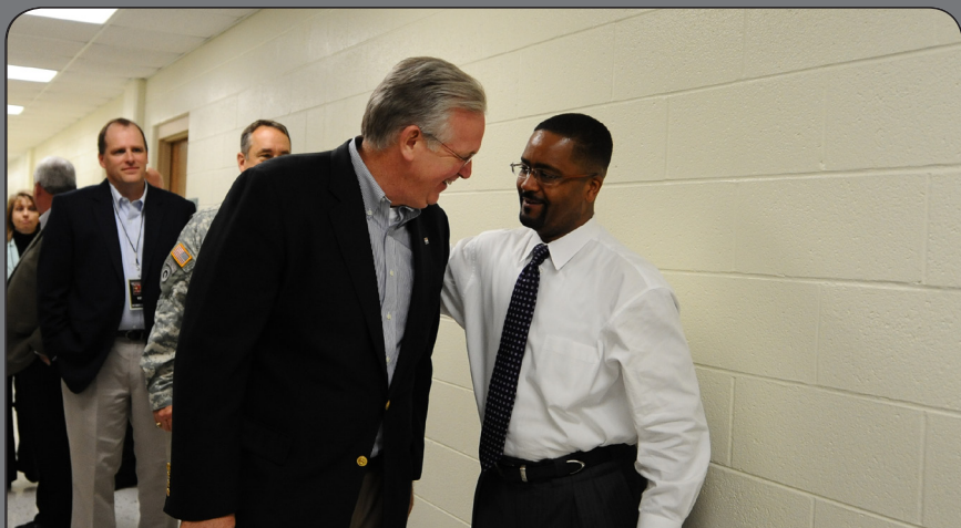
Missouri Governor Jay Nixon and Head Coach Frank Haith talk before Mizzou and Missouri Southern participated in the One State, One Spirit Classic. The national TV event helped raise funding and awareness for the victims of the deadly May 22, 2011, tornado in Joplin, Mo.