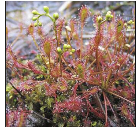
Drosera intermedia.