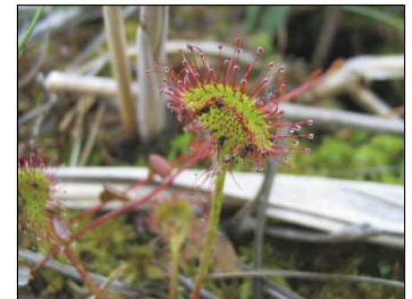
Drosera rotundifolia leaf close-up.