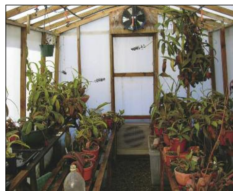
Paul's Nepenthes greenhouse built with polyflute.