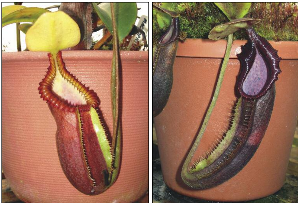
Nepenthes macrophylla (left) and Nepenthes bongso .