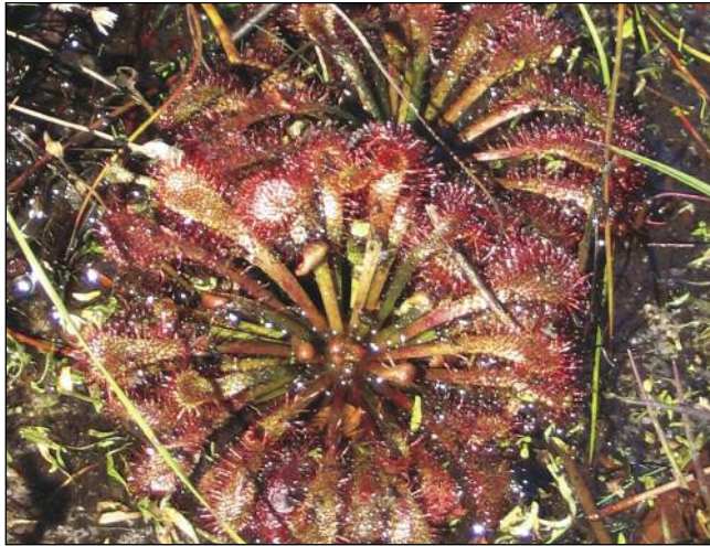
Drosera spatulata from Maddens Plain, NSW, 5cm in diameter.