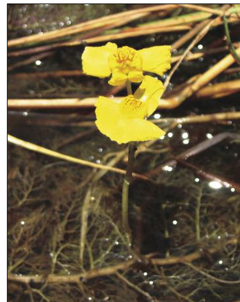
Utricularia australis flowering in the wild.

Many months later the system is still stable (pH 6.5). I have removed the old grass cuttings and replaced them with new ones. This should be done every two to three months for the carnivorous plants to