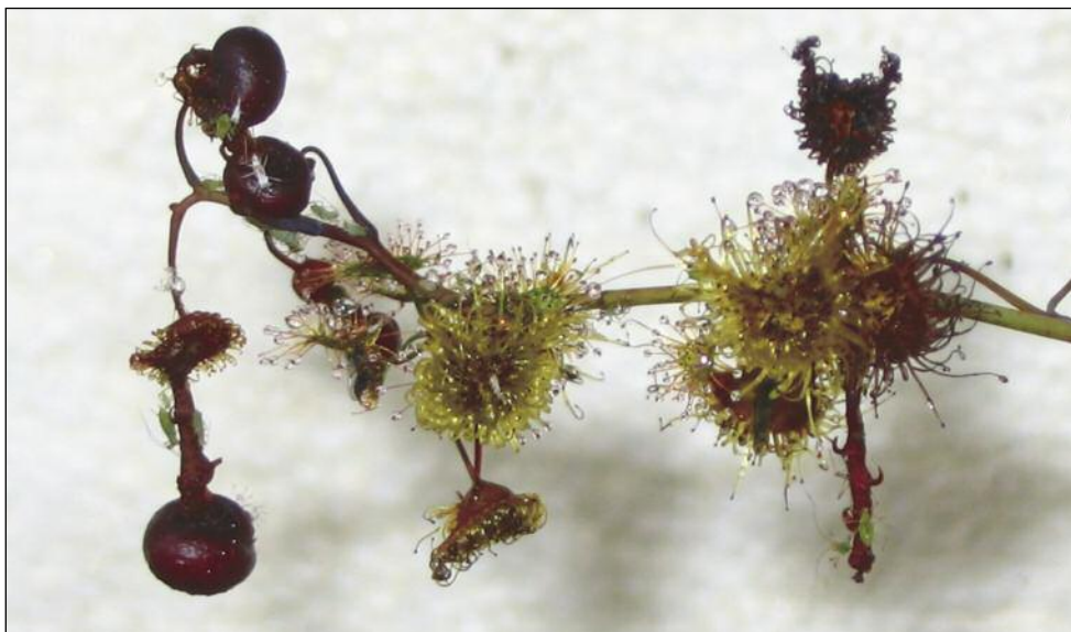
A close-up shot of D.gigantea ssp gigantea tubers being produced from the leaves in mid-air.