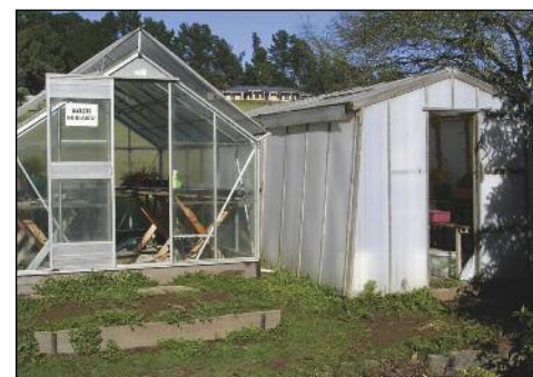
Two of Paul's greenhouses.

Every year or two, it is beneficial to repot the plant. This is especially important if you water using mains water, rather than rain water (see the watering section below). By repotting, it freshens up the mix and gives your plant a bit of a boost. Also, pots can get a bit grotty after a while, and having a great looking, clean pot compliments the plant.