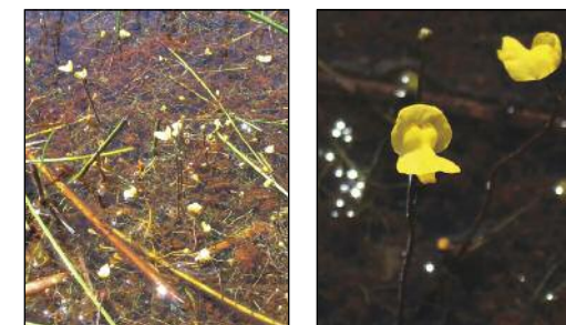
Utricularia gibba in flower at Toolooma lake.