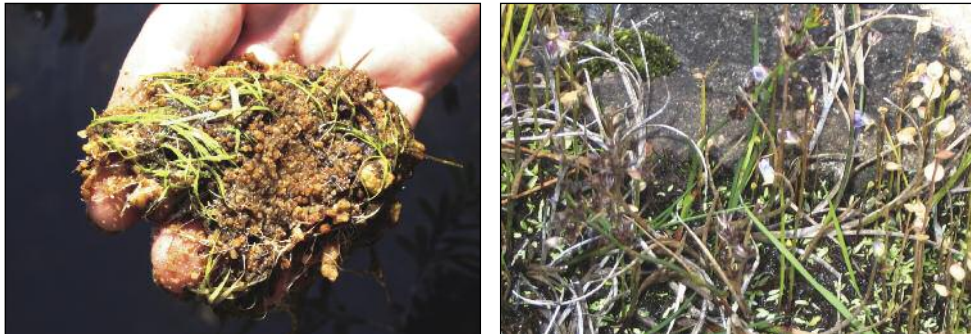
Carnivorous plants found at Toolooma Lake. (clockwise from top left): A large Drosera spatulata reaching 5cm in diameter. Drosera spatulata forming a 2cm column of old leaves. Utricularia uniflora in flower. Utricularia uliginosa in flower and a Utricularia uliginosa clump with elongated leaves growing at the bottom of a small pond.

common with a couple reaching 5cm in diameter in the shade of overhanging trees which amazed me, as I have never seen them larger than 3cm. The D. spatulata could also be seen on higher ground growing in much drier and brighter conditions. These plants were smaller than the ones seen prior but the rosette had formed a column of old leaves up to 2cm high. D. pygmaea was also scattered around these areas but they grew mainly in the drier patches.