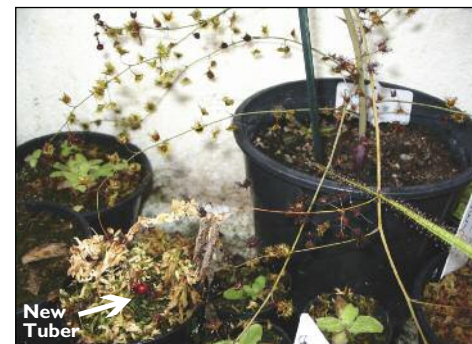
Propagating D.gigantea ssp gigantea in sphagnum using a layering technique.

One drawback was that this form of propagation affected the size of the parent tuber. My friend – the source of the plant – told me that the tuber had been larger the previous year than what it developed into this year. For this reason this may be a procedure that you only try every few years so that you don't exhaust the parent plant.