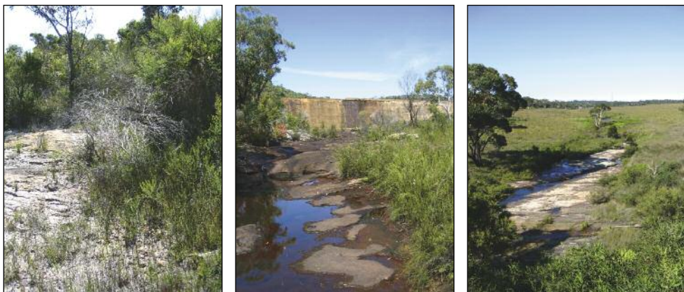
The three Carnivorous plant habitats we visited in NSW. (from left): Princess Highway between Waterfall and Helensburgh, Toolooma Lake and Maddens Plain.