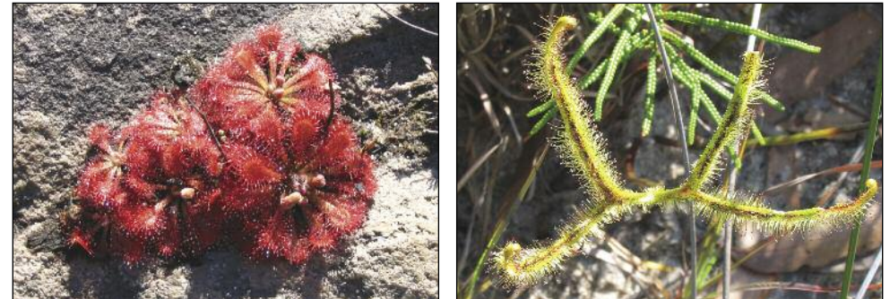
Carnivorous plants found at Maddens Plain. (clockwise from top left): A pale form of Utricularia uniflora . Utricularia uliginosa in flower. Utricularia dichotoma in flower. Drosera binata var. dichotoma growing amongst some grass on the bank of a small creek and a clump of Drosera spatulata growing in the cracks of a rock.