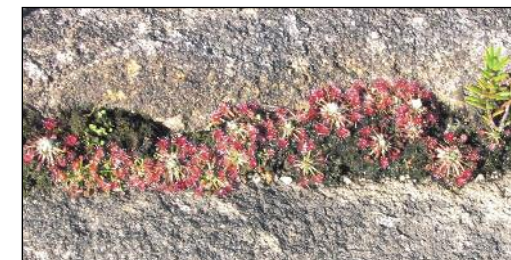
Drosera pygmaea growing in the cracks of a rock slope next to the Princess Highway.

As we moved further down away from the dam wall, small patches of U. uliginosa could be seen growing in clumps wherever the soil collected on the rocky path. We also passed a couple of small pools of water in which you could see elongated leaves of U. uliginosa growing aquatically and drawn out by the filtered light. D. spatulata became more