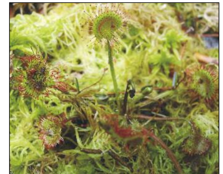
Drosera rotundifolia .