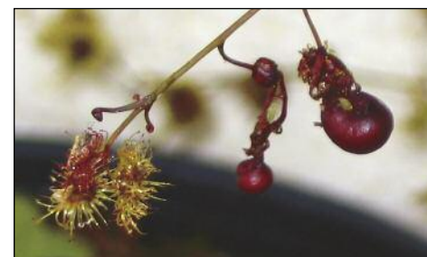
D.gigantea ssp gigantea tubers being formed.

However, compared to growing D. gigantea ssp gigantea from seed, the layering method is definitely a very effective way of producing lots tubers of a reasonable size, very quickly.