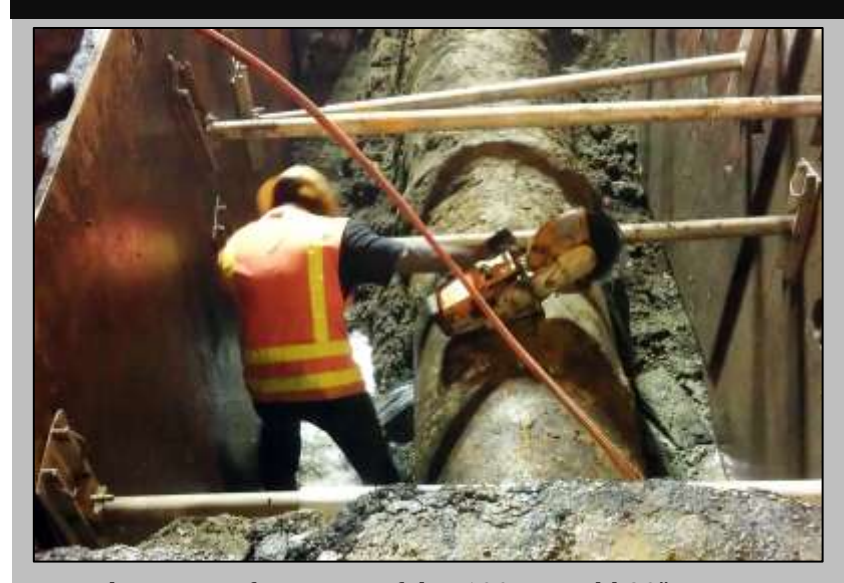
Replacement of a section of this 100 year old 30" water main at 7^{th} and Jackson is part of the Streetcar's utility work