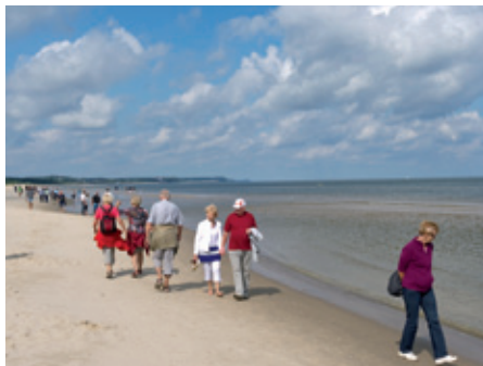
Enjoying a walk along Ahlbeck beach on the island of Usedom

Please take the opportunity to view the exhibition about the four cluster initiatives under the EU programme for the Baltic Sea Region parallel to the event.