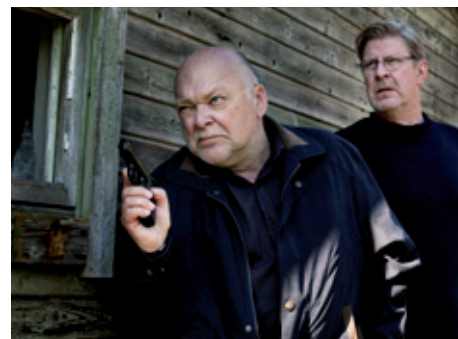
“Dark Secrets” with Rolf Lassgård

Sixteen-year-old Roger is missing. Run away from home and heading for Stockholm, the police assume. Days later he is found brutally murdered in Västerås forest. The locals are shocked, the police at a loss and the national homicide division takes over the case. “Dark Secrets” is the celebrated crime debut of Swedish duo Michael Hjorth and Hans Rosenfeldt, much in demand in Sweden as screenplay authors and film producers. They wrote the screenplays for the successful film versions of Henning Mankell's Wallander