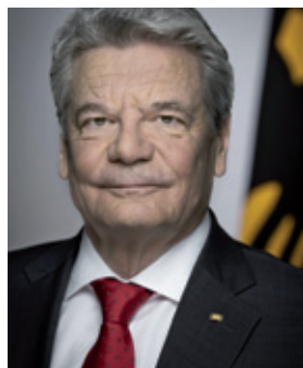
Germany's Federal President Joachim Gauck

Reception hosted by Minister of State Cornelia Pieper The Baltic Sea States will be exhibiting in their pavilions