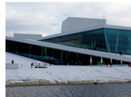
The opera house in Oslo, Norway

The Northern Dimension Steering Group, which is composed of representatives of the four partners European Union, Iceland, Norway and Russia, was established to ensure that work in this sphere is ongoing. As a rule, it meets three times a year.