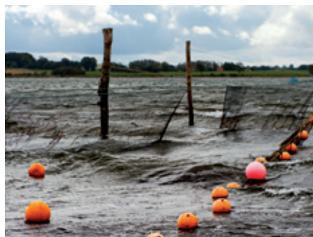
Fishing net in Denmark

This year the workshops will deal with youth and environment policy, social affairs, human rights and civic participation.