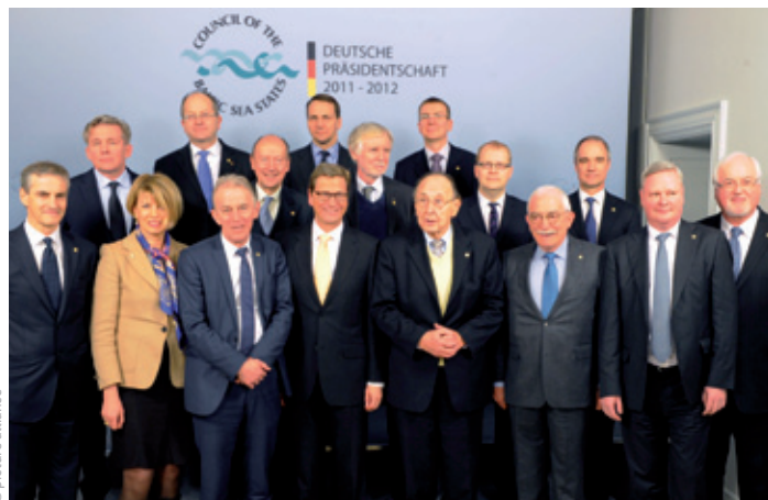
The participants in the foreign ministers meeting gathering at Plön Castle for an extraordinary session, to mark the 20 th anniversary of the regional forum being established

Special mention should be given to the Baltic 21 process, established back in 1996, which promotes sustainable development and the adaptation of the Baltic Sea Region to climate change. The Task Force against Trafficking in Human Beings and the Expert Group for Cooperation on Children at Risk continue to work very successfully.