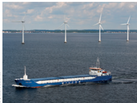
An off-shore wind farm in the Sound off Copenhagen, Denmark