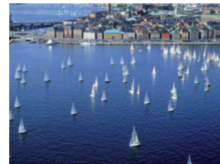
A summer regatta in Stockholm, Sweden

Since the Riga Summit in 2008, the work of the CBSS has been considerably more project-