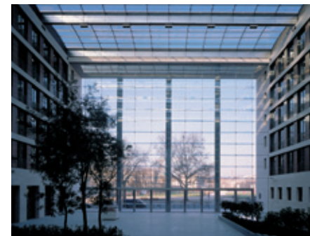
The atrium at the front entrance to the Federal Foreign Office

The exhibition in the Atrium of the Federal Foreign Office offers visitors the chance to learn about the work of the CBSS and about how the Baltic Sea states contribute to cooperation in the region.