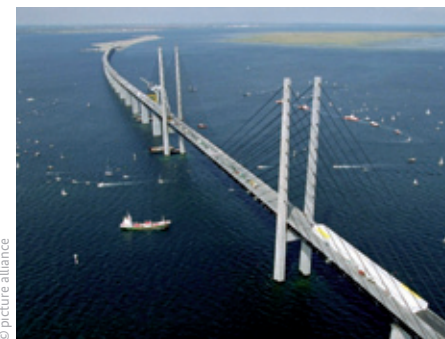
The 7.8-kilometre Öresund Bridge linking Denmark and Sweden

The steering bodies of the EU Strategy for the Baltic Sea Region, the CBSS and the Northern Dimension are meeting for a joint informal session.