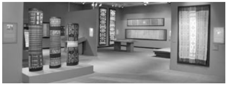
Speaking with Cloth, Cerita Dalam Kain – Gallery shot.

This initiative of producing a bilingual catalogue, due to the assistance of the Institute, has enabled the MAGNT to make its Southeast Asian Art and Material Culture collections accessible to neighbouring Indonesian speaking communities. It also highlights and strengthens the interactive nature of its relationships with Indonesian cultural organisations, artists and cultural workers in Indonesia which have been established through cultural and training exchanges, exhibitions and collections development and research over numerous years.