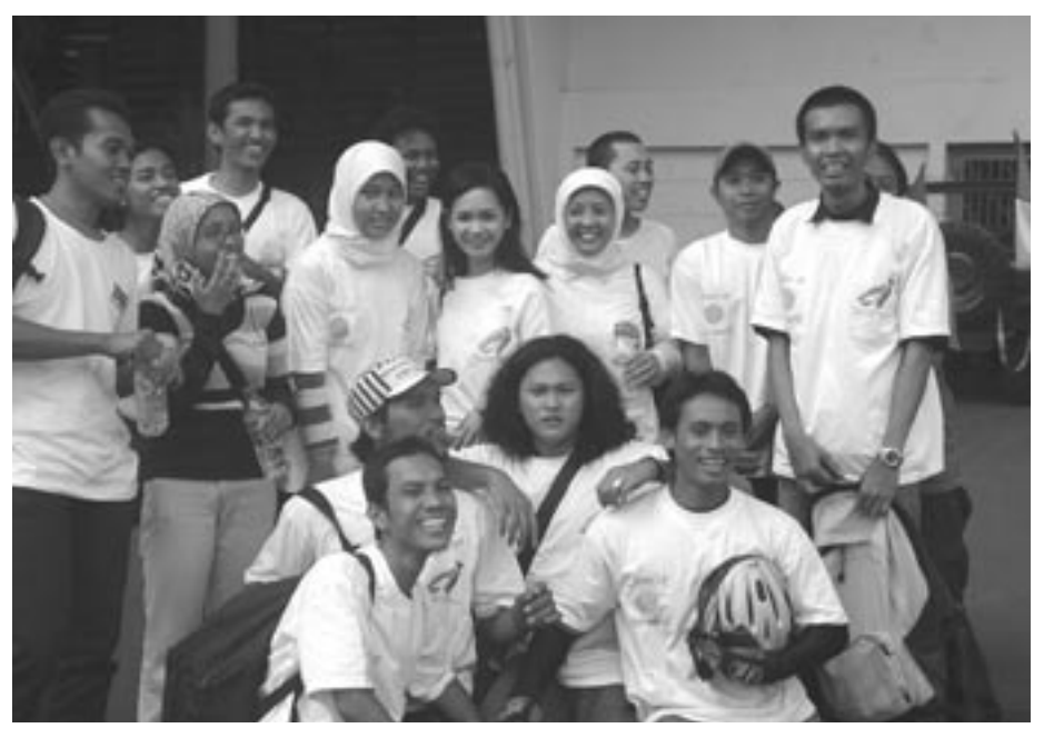
Some of the many young people who participated in the Clean Up The World campaign in Senayan on 8 August 2004 undertaken by Clean Indonesia Foundation.