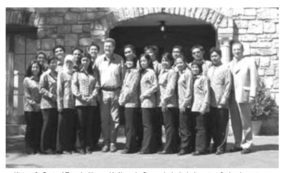
Minister for Foreign Affairs, the Honourable Alexander Downer, had a lively discussion of cultural experiences and bilateral matters with Indonesian participants in the Australia-Indonesia Youth Exchange Program during their visit to South Australia.

At its March 2005 meeting, the Board of the Institute agreed that the component of the program for Australian participants should resume in 2005-06, subject to local conditions. The visit to Indonesia had not proceeded since 2002.