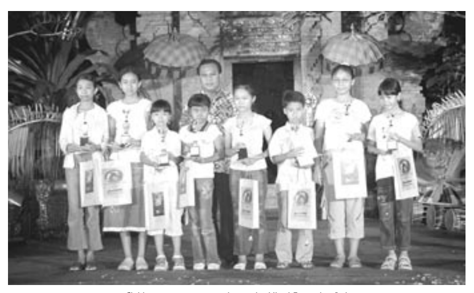
Children receiving prizes during the Ubud Festival in Bali.

The Institute provided funding to the inaugural Ubud Writers and Readers Festival, a week-long program of arts and literary performances, discussions and workshops in central Bali. The international festival brought together established and emerging Asian and Australian writers and writers on Asia.