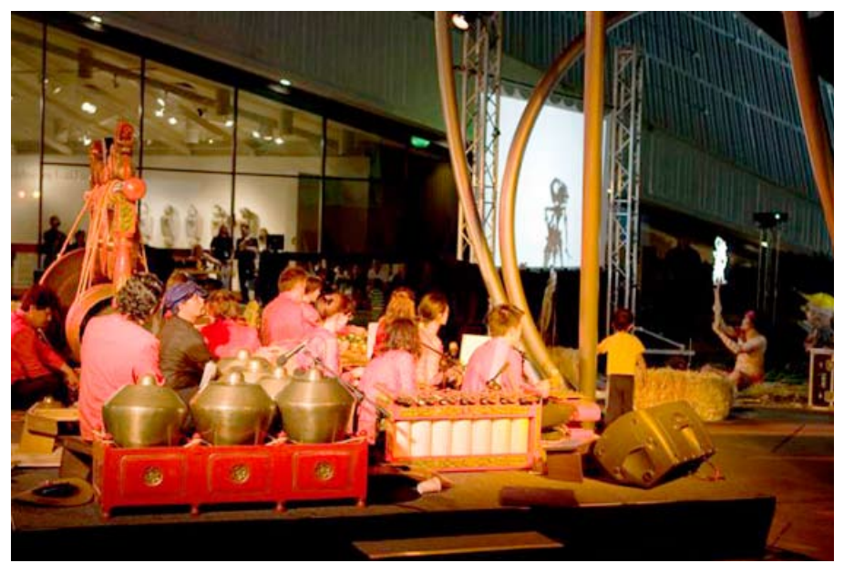
Shadow puppet and gamelan orchestra performance at the 2008 OzAsia Festival