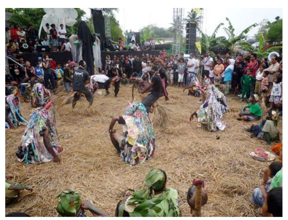
TUK Mata Air Festival 4

Telephone No. (62-21) 2550 5265 Facsimile No. (62-21) 522 7104