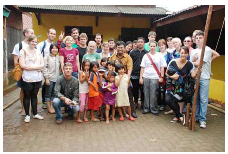
ACICIS Journalism Professional Practicum students during a field trip to Bantar Gebang rubbish tip in Jakarta in 2009

The All contributed funding to this ACICIS program (Australian Consortium for In-Country Indonesian Studies), run by Murdoch University. Thirty-three journalism and communications students from Australia and New Zealand spent six weeks in Jakarta: two weeks in classes learning about Indonesian language and culture, and four weeks in internship placements at an English-speaking Indonesian media outlet.