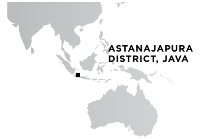
ASTANAJAPURA DISTRICT, JAVA