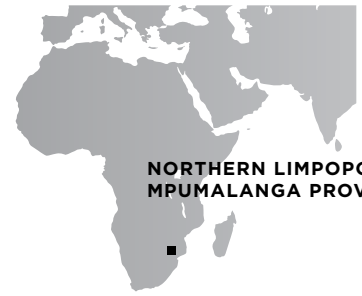
NORTHERN LIMPOPO & MPUMALANGA PROVINCES