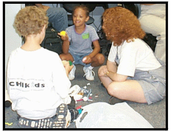
Figure 1: Children and adults collaborating as design partners in our HCI lab

This strategy of working with children as partners is something we have come to call Cooperative Inquiry [6]. It combines and adapts the low-tech prototyping of