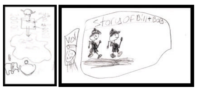
Figure 2: Note from children's journals on what an animal digital library should look like

We had two children use a particular technology and one teacher and one university researcher observe their use. While the children were using the technologies the adults were writing down what the children were saying and doing during the session. Meanwhile the children were also taking notes. They wrote on "sticky notes" three things they liked about what they were using and three things they