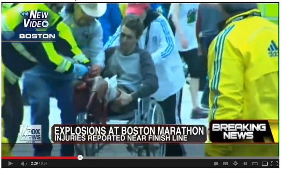
RAW FOOTAGE: Terrorism Strikes Boston Marathon As Bombs Ex...