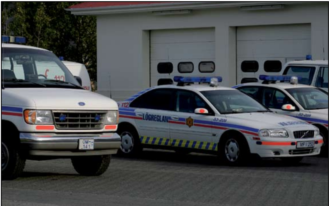
A fleet of Police vehicles.

The Ministry of Justice also serves as a central authority in international mutual assistance in criminal matters and receives requests for such assistance, such as concerning extradition or confiscation of property deriving from criminal offences committed abroad.