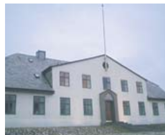
Now housing the Prime Minister's offices, this building on Arnarhóll in Reykjavík was Iceland's first prison.

The building now houses the prime minister's office. About fifty years later another prison was built in Reykjavík, Hegningarhúsið (1874). Currently there are five prisons in Iceland, two of them, including the Hegningarhúsið, are situated in the capital area and three in the country. The largest prison, Litla-Hraun, which is situated about 65 kilometres south-east of Reykjavik, was established in 1929, when a hospital building was converted into a prison. A new prison building for 55 inmates has been constructed at Litla-Hraun so the prison currently houses up to 87 inmates. (Ref.: Sigurðsson, J. F., 1998)