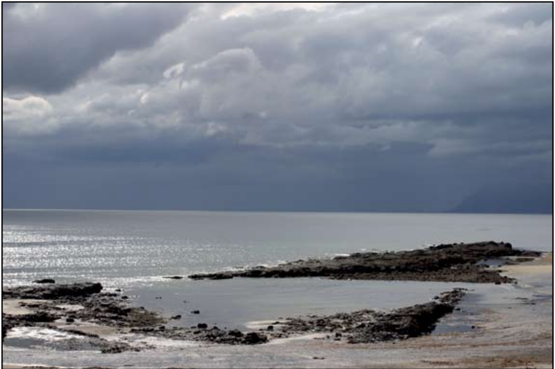
An evening view from the Barðaströnd coast in Western Iceland.

Iceland is a volcanic island situated in the northwest part of Europe, just below the Arctic Circle. The island is volcanic and is 103,000 square kilometres. Most built-up areas are scattered around the coastline which is 4,970 km long. On 31 December 2004 the number of inhabitants was 293,577. The population is not evenly distributed and about 180,000 persons reside in Reykjavík, the capital, and the neighbouring communities.