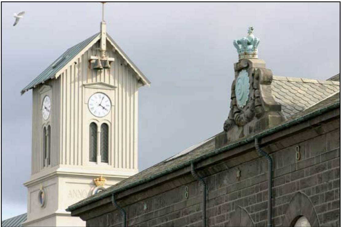
The Reykjavík Cathedral (tower to the left) was officially opened in the year 1796 and the parliament building (to the right) in 1881.