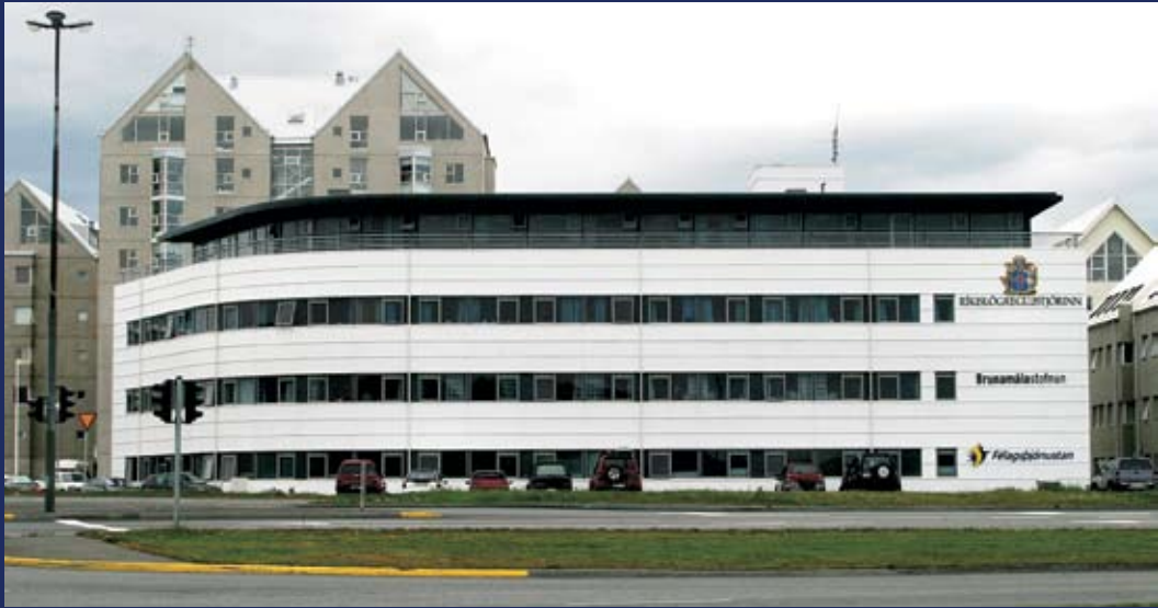
The Office of the National Commissioner of Police at Skúlagata 21, Reykjavík