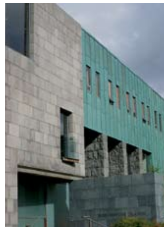
The Supreme Court house.

The Supreme Court, the highest court in Iceland, was established by law in 1919. The Court acts as a Court of Appeal. The Supreme Court consists of nine judges of which three to five are assigned to each case (seven in very serious or important cases).