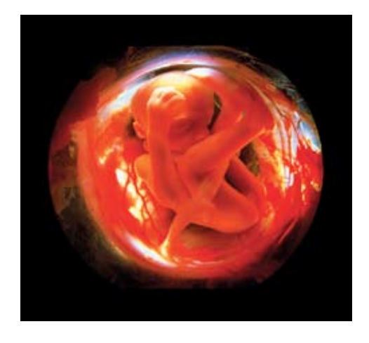
LENGTH: 6 - 1/4 inches WEIGHT: 3/4 of a pound

By 20 weeks, fine, downy hair has begun to appear on the remainder of the body of the fetus. Functions associated with respiratory processes begin, although the lungs of the fetus are not yet fully developed. The exchange of oxygen and carbon dioxide is still done in the placenta at this point. At 20 weeks, the fetus cannot survive outside of the uterus.