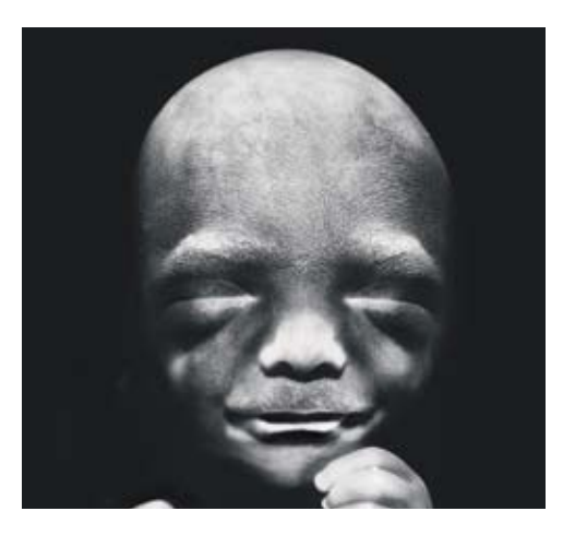
LENGTH: 8 - 1/2 inches WEIGHT: 1 - 1/4 pounds

By 24 weeks, eyebrows and eyelashes are more noticeable. The skin of the fetus is wrinkled, but still very thin. At this point in the development, the first layers of fat are beginning to form, and a fetal skeleton can be recognized.