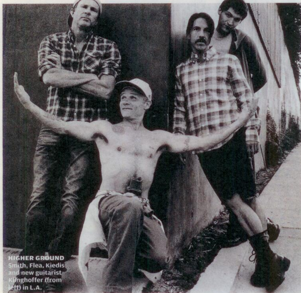
HIGHER GROUND Smith, Flea, Kiedis and new guitarist Klinghoffer (from left) in L.A.