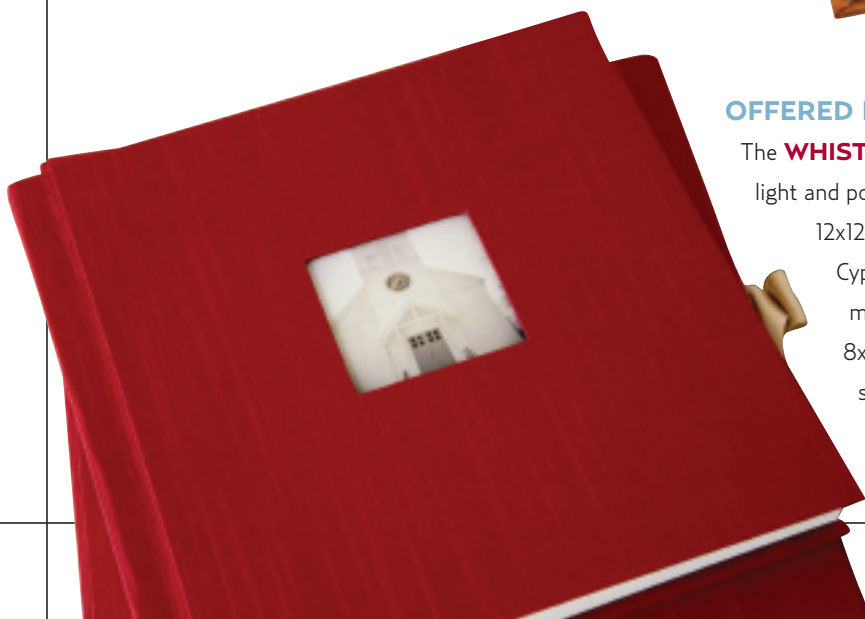
The Whistler Book

The WHISTLER BOOK is a flush-mounted album with thin pages, making it light and portable, even with more pages. Available in 8x8, 8x10, 10x10 and 12x12 inches, it can hold up to 30 pages (60 sides) with a cover in any Cypress fabric. The IRIS BOOK is a sophisticated-looking flush-mounted album with a clean, modern style. Available in 5x5, 8x8, 8x10, 10x10, 12x12, 11x14 inches with over 18 cover choices in Japanese silks and linens. Presentation box optional. cypressalbums.com