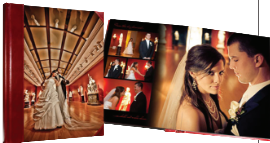
The Metal Cover Album

EXTREME PANOS are hinged on top. Available in 8x20, 6x15 and 4x10 inches in vertical, side-fold or horizontal top-fold format. The beautiful one-piece photo covers are printed on luster, pearl or velvet finish paper, and protected by a scratch-resistant lamination. Gallery lie-flat binding. Gorgeous METAL COVER ALBUMS are available in 12 sizes. The Aluminescence option allows the metal to show through, and Brilliant comes in true white and brilliant colors. There are many back, spine, and protective corners choices. You can have your image imprinted on a leather cover available in 17 sizes and accented with embossed croc or smooth finish. hcolorlab.com