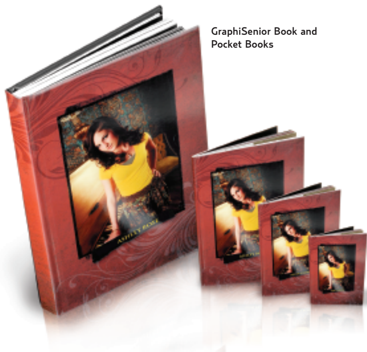
GraphiSenior Book and Pocket Books

The GRAPHISENIOR PROGRAM features a printed hardback cover, and continuous binding for seamless, panoramic spreads. Primary books are available in vertical or square formats: 4x5, 4x4, 6x8, 6x6, 8x8, and 8x12. All books are available with up to 30 pages, printed on photographic, metallic, smooth or textured paper. POCKET BOOKS are clones of the primary book, available in 2x2, 2x2.5, 2.5x2.5, 2.5x4, 4x4 and 4x5 inches. Register for a free stock senior book at 866-472-7445. graphistudio.com