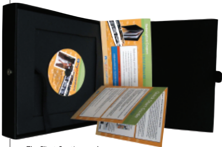
The Client Creations package