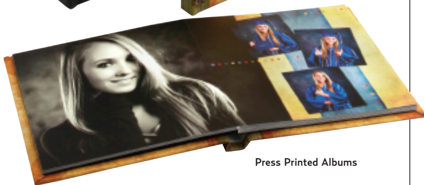
Press Printed Albums