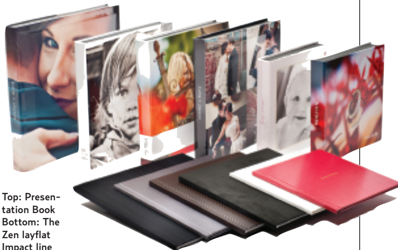
Top: Presentation Book Bottom: The Zen layflat Impact line

The ZEN LAYFLAT IMPACT line of coffee table-style photo books has new cover choices: black microsuede, brown carbon fiber, brushed metal silk, onyx silk, pearl silk and retro red. The laminate page finish continues seamlessly into the binding of the book for a full two-page spread. Available in 8x8, 10x10, 12x12 and 15x10 inches, with up to 100 laminate matte or glossy pages. The designable presentation box, lined with black felt, includes a DVD sleeve. DVD PRESENTATION BOOKS hold a DVD alongside a printed, bound photo book with glossy-coated hard pages, all in a slide-in case. Opposite the book is a single DVD placeholder protected by vellum paper. It measures 5.5x8 and can accommodate 6- to 10-page photo books. asukabook.com