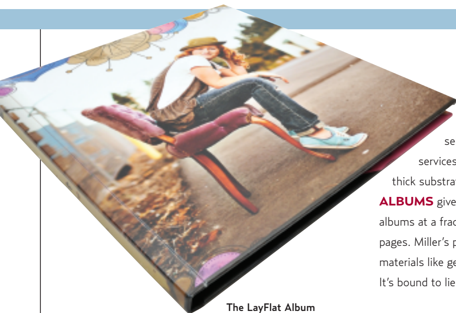
The LayFlat Album