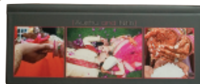
Clockwise from top left: the Brilliant Album, Acrylic Album and Matte Album