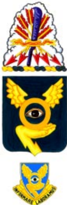
1st Military Intelligence Battalion

Motto: INFORMARE LABORAMUS (WFLAVOR TO INFORM). Symbolism: Teal blue and yellow are the colors formerly used for air reconnaissance support battalions. The annulet, symbolic of a camera lens,