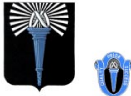
165th Military Intelligence Battalion

Symbolism: Oriental blue is the primary color associated with military intelligence organizations. The torch is symbolic of the illumination provided by the collection and dissemination of intelligence data. The black background suggests secrecy and stealth. The ribbon-like symbol, in place of a flame, folds back on itself and is representative of the counterintelligence mission.