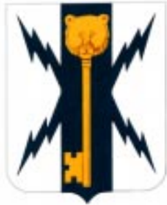
309A Military Intelligence Battalion