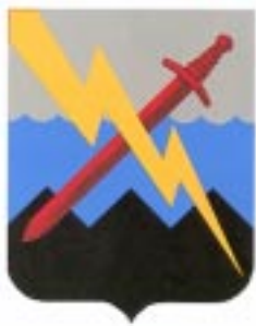
102d Military Intelligence Battalion

Constituted 16 September 1981 in the Regular Army