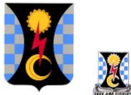
109th Military Intelligence Battalion

Symbolism: Silver gray and oriental blue are the colors of military intelligence. The checkered arrangement reflects the multifaceted intelligence and electronic warfare capabilities of the battalion. The black center field suggests secrecy and symbolizes tactical operations security. The sun and moon symbols and two hemispheres denote round-the-clock tactical and global deployment capabilities. The red flash is a symbol of the offensive combat capability of electronic warfare as well as the long range electronic surveillance characteristics of the battalion.