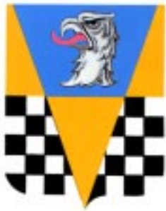
326th Military Intelligence Battalion