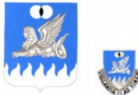
15th Military Intelligence Battalion

Constituted 6 January 1966 in the Regular Army as the 15th Military Intelligence Battalion. Activated 25 February 1966 at Fort Bragg, North Carolina. Inactivated 30 April 1972 at Fort Bragg, North Carolina. Activated 21 April 1978 at Fort Hood, Texas (Detachments A, B, C, and D concurrently consolidated to form Company A; 13 1st Military Intelligence Company [see ANNEX I] and 156th Army Security Agency Company [see ANNEX 2] reorganized and redesignated as Companies B and C). Headquarters and Headquarters Company inactivated 31 May 1981 at Hunter Army Airfield, Georgia (Company C concurrently inactivated at Fort Bliss, Texas). (Company A inactivated 15 April 1982 at Fort Hood, Texas; disbanded 15 September 1983. Company B reorganized and redesignated 16 September 1983 as Company A; Company C concurrently redesignated as Company B.) Headquarters and Headquarters Com-