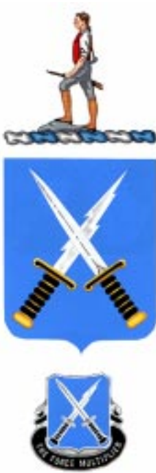
301st Military Intelligence Battalion

Symbolism: Oriental blue and silver gray are the colors associated with military intelligence. The crossed dagger and lightning flash dagger form an X, suggesting the unit's motto. They symbolize strength, danger, speed, and the precise application of electronic warfare and intelligence to defeat the enemy.