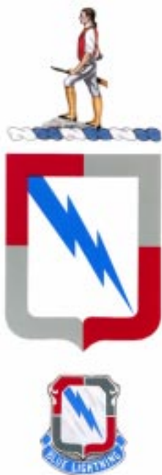
550th Military Intelligence Battalion

Symbolism: Oriental blue and silver gray are the military intelligence colors. Blue also alludes to the battalion's affiliation with the 50th Armored (Jersey Blues) Division. The colors red and white were suggested by the shoulder sleeve insignia of the 78th Division (Training), to which the battalion was attached. The lightning bolt relates to the battalion's signal security and electronic warfare mission. The quartered border signifies military strategy.