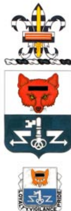
302d Military Intelligence Battalion

Organized 1 April 1944 in England as the 3252d