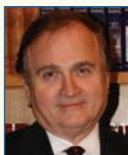
Nicholas A. Peppas

Founder of biomedical engineering. Pioneered use of films and surfaces in biomedical applications — rheological and clotting properties of human blood; polyethylene oxide as biomaterial; molecular transport across membranes; artificial kidneys, blood oxygenation and accompanying CO 2 removal during open heart surgery.