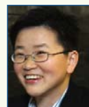
Jackie Y. Ying

Recognized for work on design and yield improvements of recombinant protein production; cell-free methods in developing patient-specific cancer vaccines, having so produced active complex hydrogenases enzymes; improved water filters based on the protein Aquaporin Z's ability to pass only water, possibly leading to highly selective biosensors