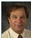
Jacob N. Israelachvili

Recognized for work in generalized Flory dimer theory and Hall-Helfand correlation function; simulation of amyloid fibrils formation.