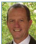
John C. Crittenden

Recognized for work on continuous-flow membrane filtration of plasma from whole blood; continuous-flow membrane plasmapheresis; theoretical models for flux and hemolysis; artificial pancreas.