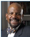
Cato T. Laurencin

Recognized for developing and scaling up new approaches and materials for process chromatography, absorptive bioseparations, and biocatalysis.