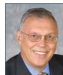
Larry F. Thompson

Recognized for seminal reactive multicomponent mixing research. Toor Test is industry standard for assessing relative mixing and reaction rates.