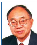
Norman N. Li

sound drug delivery and growing engineered muscle tissue and engineered blood vessels. Youngest person ever elected to all three American National Academies.