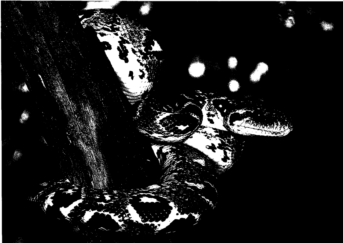
Above: Sanzinia madagascariensis . Below: Furcifer labordi .