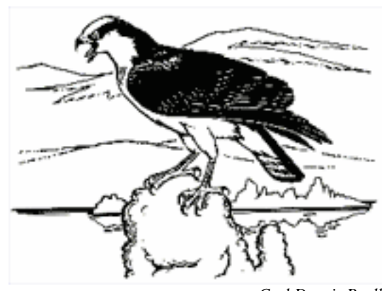
Carl Dennis Buell

The scientific name for Osprey is Pandion haliaetus , which means "sea eagle." There is only one species of Osprey found in the world, yet they have worldwide distribution—wintering or breeding on every continent except Antarctica. Also known as the "fish hawk," a unique characteristic of this fascinating bird of prey is that it is the only raptor that plunges into the water for fish. In fact, fish make up about 99% of an Osprey's diet.