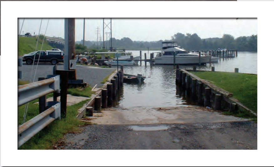
Oak Creek Landing in Talbot County — which sees more than 5,000 launches each year — underwent renovations last November including a larger ramp and pier, a repaved parking area, solar powered security lighting and new bulkhead.