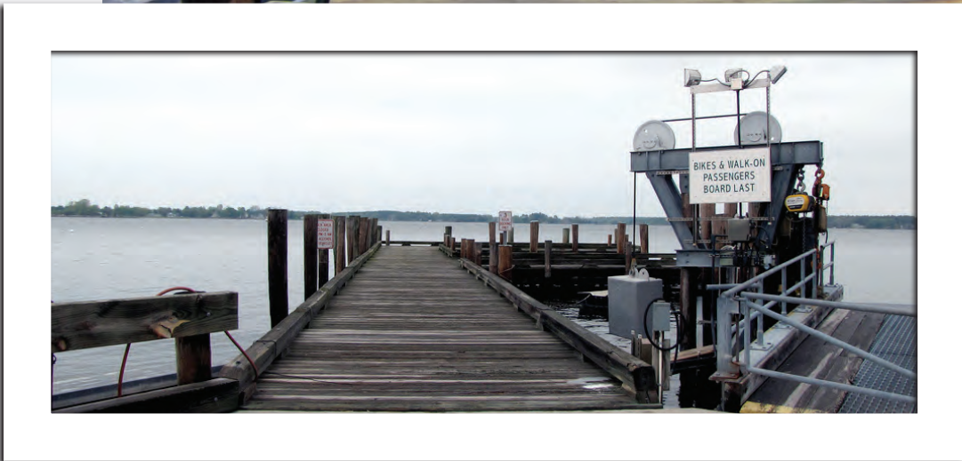
The Town of Oxford's Timber Dock was re-configured, expanded and rebuilt to accommodate larger, recreational transient boats. The former dock had been deteriorating.