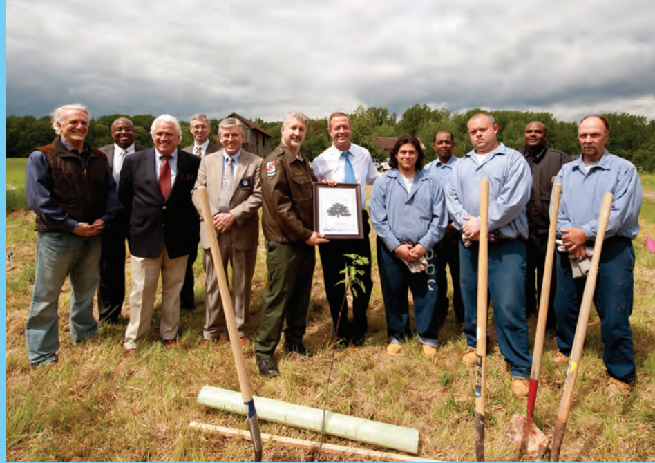
The Forest Brigade planted its millionth tree in 2011.

In April 2012, the Arbor Day Foundation presented Governor O'Malley with its inaugural Vision Award . The new honor, which will be awarded only as merited, was created to recognize individuals who inspire and advance extraordinary on-the-ground actions to achieve the full benefits of trees and forests. Governor O'Malley was honored for his unparalleled commitment to