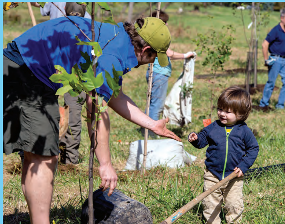
A youngster pitches in at Patapsco Valley State Park.