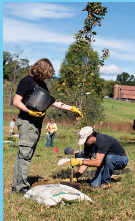
Volunteers plant trees to serve their community.

INSECTS • BIRDS • SCENERY • PEOPLE ENJOYING STATE PARKS • WILDLIFE • PLANTS