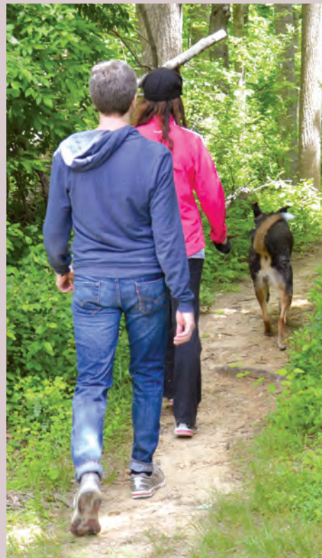
Leading the way down Tall Poplar Trail at Patapsco.