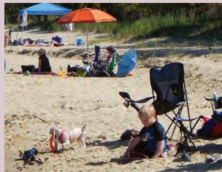
Playing fetch on the sand at Point Lookout.