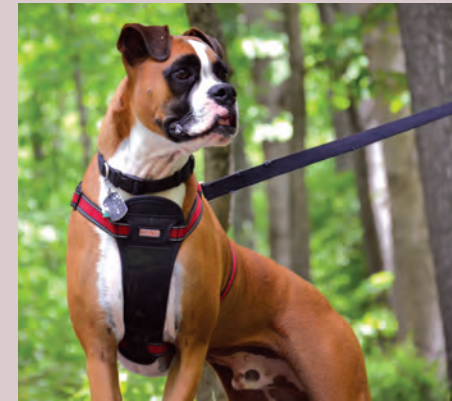
Exploring the McKeldin Area of Patapsco.

pursuits than ours? Keenly nicknamed America in Miniature , the diverse topography provides opportunity for just about any manner of excursion.