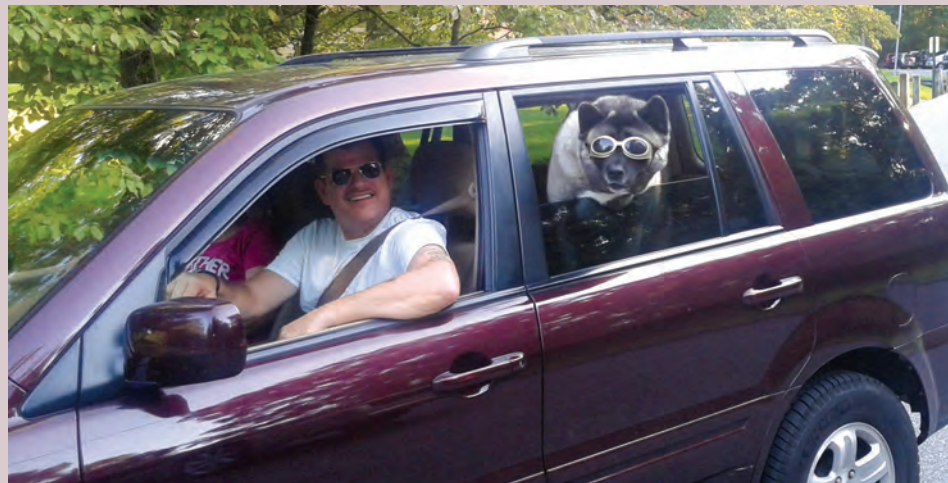
Adventure awaits at the Hollofield Area of Patapsco.