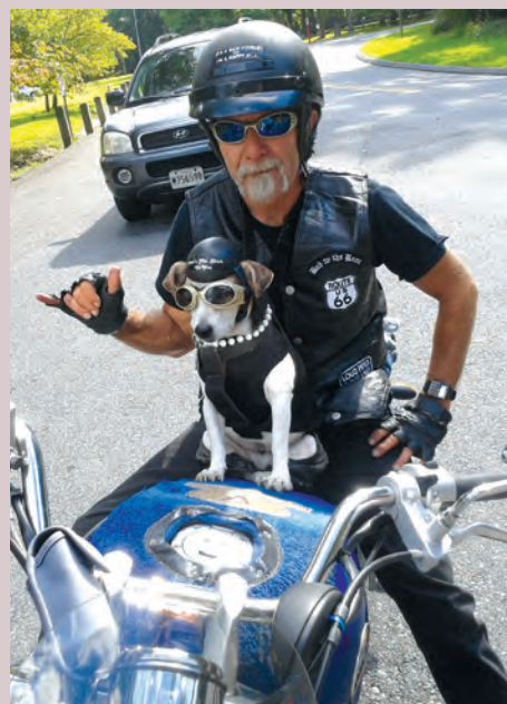
This rockin' pair heads for Patapsco's Hollofield Area.