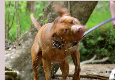
Splashing around Patapsco's Daniels Area.