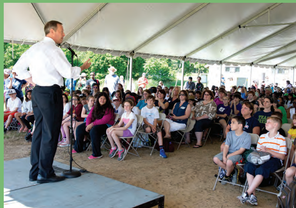
Governor O'Malley addresses 1,200 green student and teachers at the Green Schools Youth Summit at Sandy Point State Park.