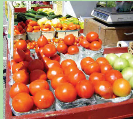
Fresh vegetables for sale