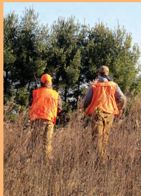
A Mentored Youth Hunt at Pintail Point on the Eastern Shore

including Junior Hunter Field Days, Mentored Youth Hunts and Becoming an Outdoors Woman — that provide wildlife management and hunting education in a safe setting.