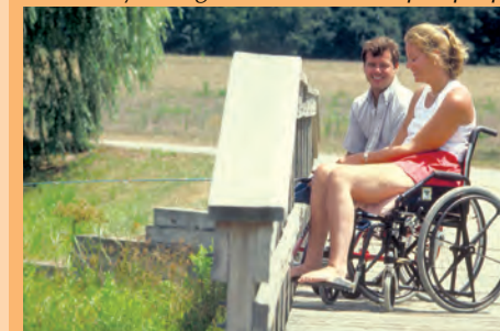
A fishing trip made possible by DNR's accessibility commitment.

dnr.maryland.gov/ofp dnr.maryland.gov/download/udpfaq.asp