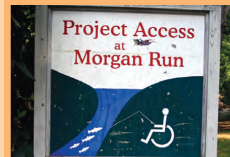
A wheelchair access platform for fly fishing is available to anglers at the Morgan Run Natural Environmental Area.

To learn more about what's to come at Harris Creek, watch the Oyster Restoration video at youtube.com/accessdnr .