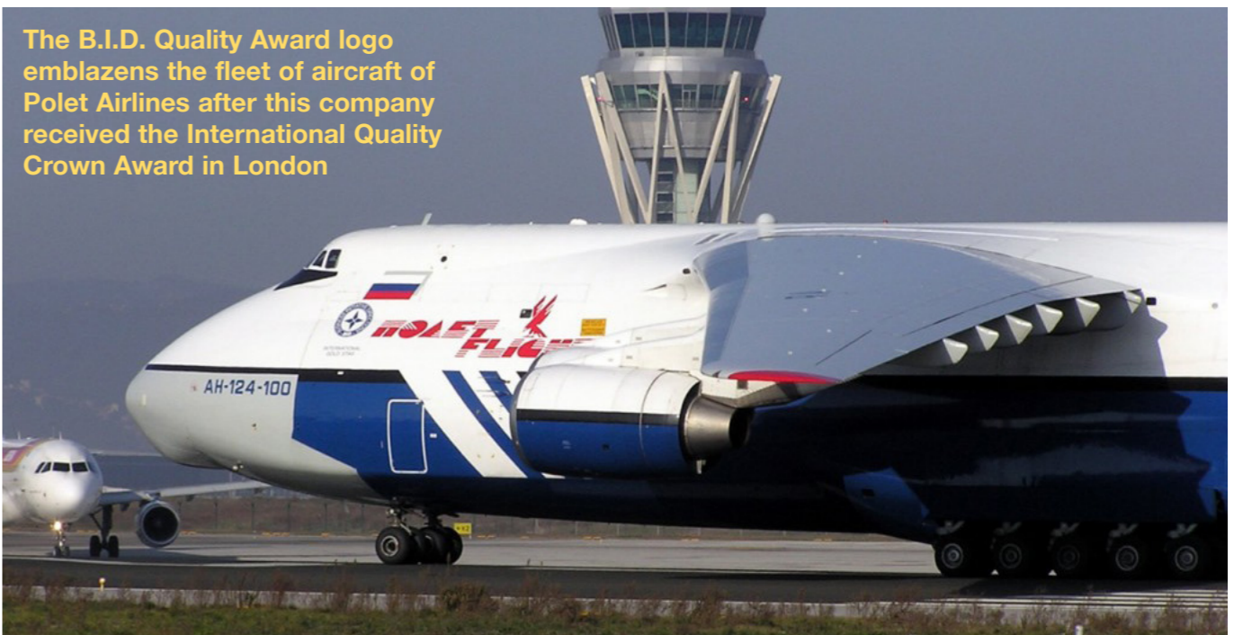
The B.I.D. Quality Award logo emblazens the fleet of aircraft of Polet Airlines after this company received the International Quality Crown Award in London

100 meet the current environmental and safety requirements with flying colors. Company representatives are proud to state that they go above and beyond the requisites listed by the International Aviation Authorities.