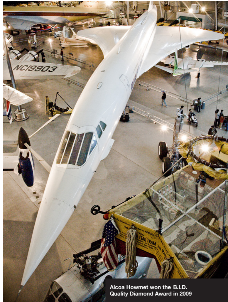
Alcoa Howmet won the B.I.D. Quality Diamond Award in 2009.

ceramic products and advanced tooling. Alcoa Howmet conducts extensive research to aid development of its material, product, and process technologies and is the top manufacturer of components for the jet aircraft, gas turbine and other advanced-technology industries. Its reliable, quality products range from investment casting raw materials and equipment to finished castings. From its operational headquarters in Pittsburgh, Penn., Alcoa operates in over 40 countries throughout the world.