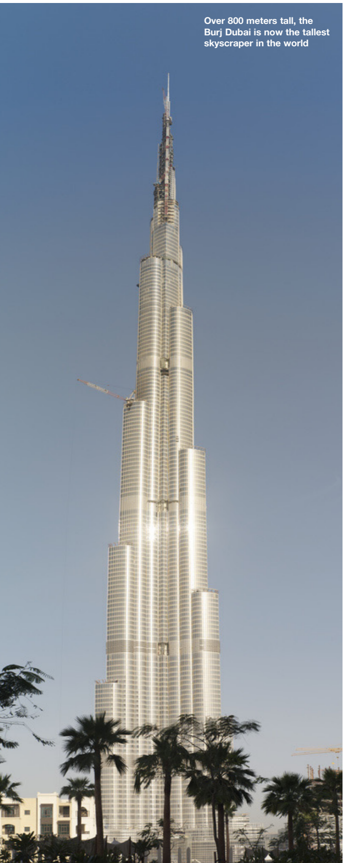
Over 800 meters tall, the Burj Dubai is now the tallest skyscraper in the world

American company has led the construction of many famous buildings, such as the United Nations Secretariat in New York, the United Airlines Terminal 1, the Madison Square Garden, the American Stock Exchange and the Rose Garden Arena. It is not surprising that Turner has been granted prestigious