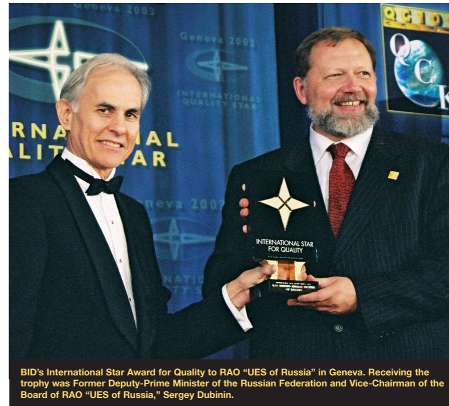
BID's International Star Award for Quality to RAO "UES of Russia" in Geneva. Receiving the trophy was Former Deputy-Prime Minister of the Russian Federation and Vice-Chairman of the Board of RAO "UES of Russia," Sergey Dubinin.