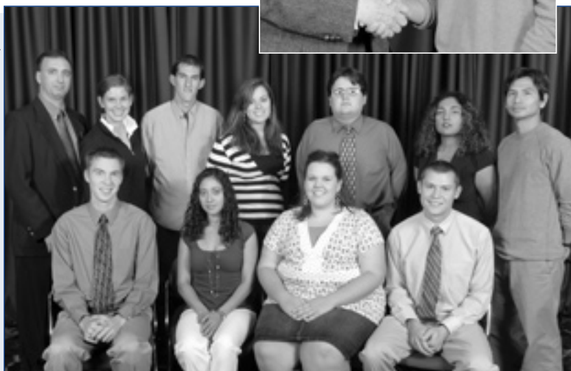
2007-2008 Scholarship Recipients