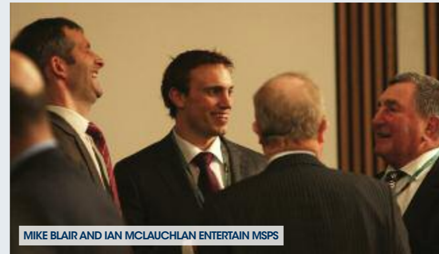
MIKE BLAIR AND IAN MCLAUCHLAN ENTERTAIN MSPS

S4M-00168 Shona Robison: Contribution of Sport to Scotland —That the Parliament recognises the important contribution that sport makes to Scotland's economy, culture and international standing; welcomes the government's commitment to increase participation in sport and physical activity, thereby creating a lasting legacy for the 2014 Commonwealth Games; notes the benefits to the physical and mental wellbeing of the Scottish people through participation in sport; acknowledges the priority given to increasing physical education in primary and secondary schools, and notes the progress being made in improving community access to sporting facilities.