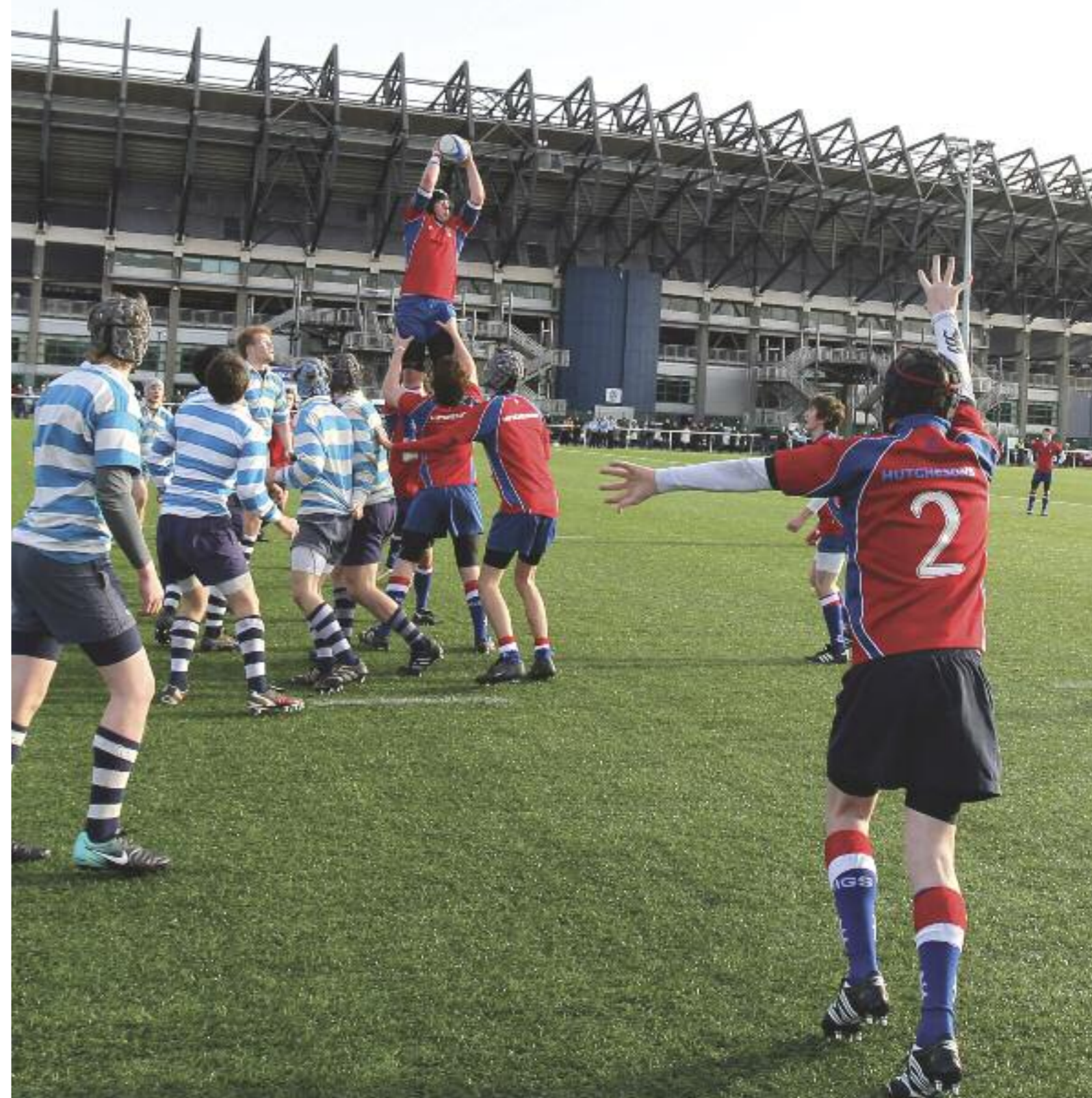
BREWIN DOLPHIN SCOTTISH SCHOOLS CUP SEMI FINAL ACTION ON MURRAYFIELD'S BACK PITCHES

Borrowing levels show an improvement over the previous year despite the ongoing investment in Murrayfield developments. Average borrowings for the year of £14.4m compare to the previous year's average of £14.8m. Year end debt of £12.7m is below the April 2010 year end debt of £15.1m mainly due to the financial surplus for the year and various working capital movements.