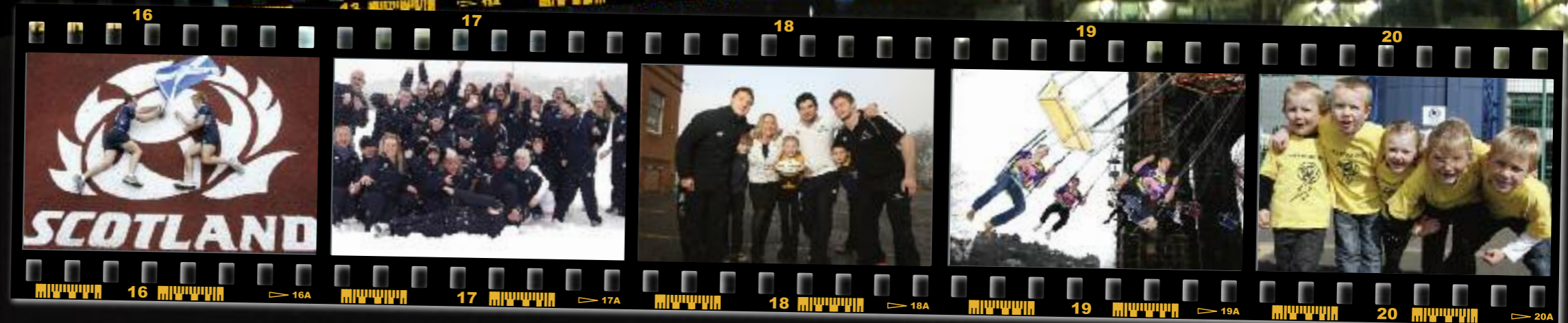
L - R: Flying the flag for Scotland 7s; training's s-no fun for Scotland Women under-20; Glasgow Warriors visit Scotstoun Primary; Edinburgh Rugby celebrate the swings and roundabouts of outrageous 1872 Cup kit; the mini Melrose massive at Murrayfield!