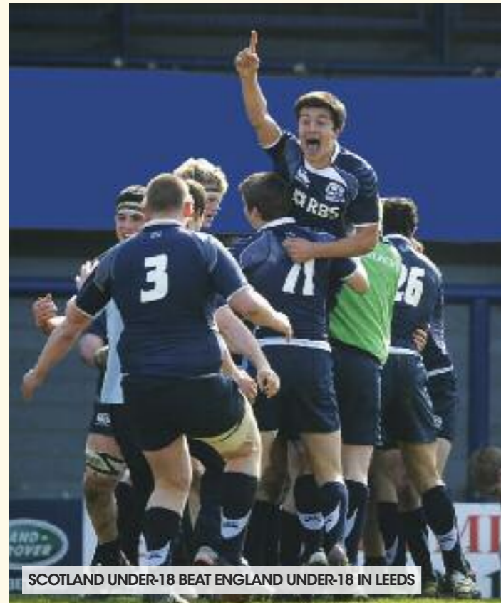
SCOTLAND UNDER-18 BEAT ENGLAND UNDER-18 IN LEEDS

Scotland Women 0 – 26 Italy Women (Meggetland, 20 March 2011)