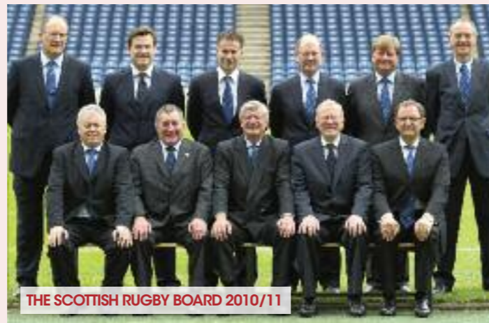
THE SCOTTISH RUGBY BOARD 2010/11

Consultation with employees or their representatives has continued at all levels, with the aim of ensuring that their views are taken into account when decisions are made that are likely to affect their interests and that all employees are aware of the financial and economic performance of their business units and of the company as a whole. Communication with all employees continues through e-mail communication, team meeting briefings, the employee forum, periodic staff briefings and the distribution of the Annual Report.