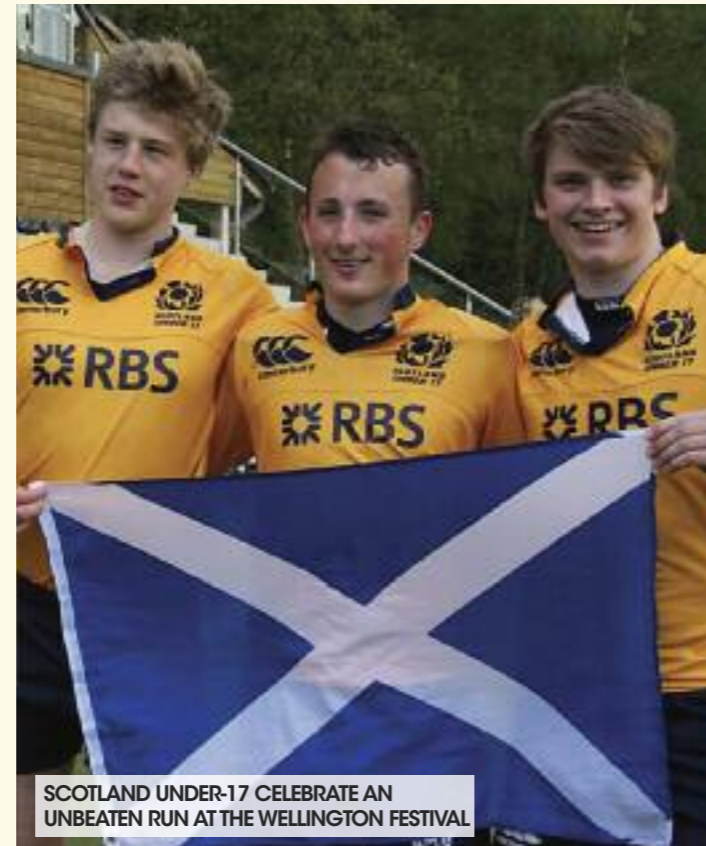
SCOTLAND UNDER-17 CELEBRATE AN UNBEATEN RUN AT THE WELLINGTON FESTIVAL