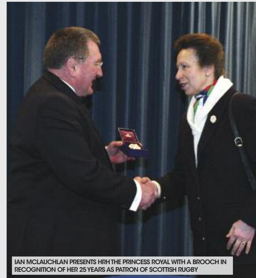
IAN MCLAUCHLAN PRESENTS HRH THE PRINCESS ROYAL WITH A BROOCH IN RECOGNITION OF HER 25 YEARS AS PATRON OF SCOTTISH RUGBY