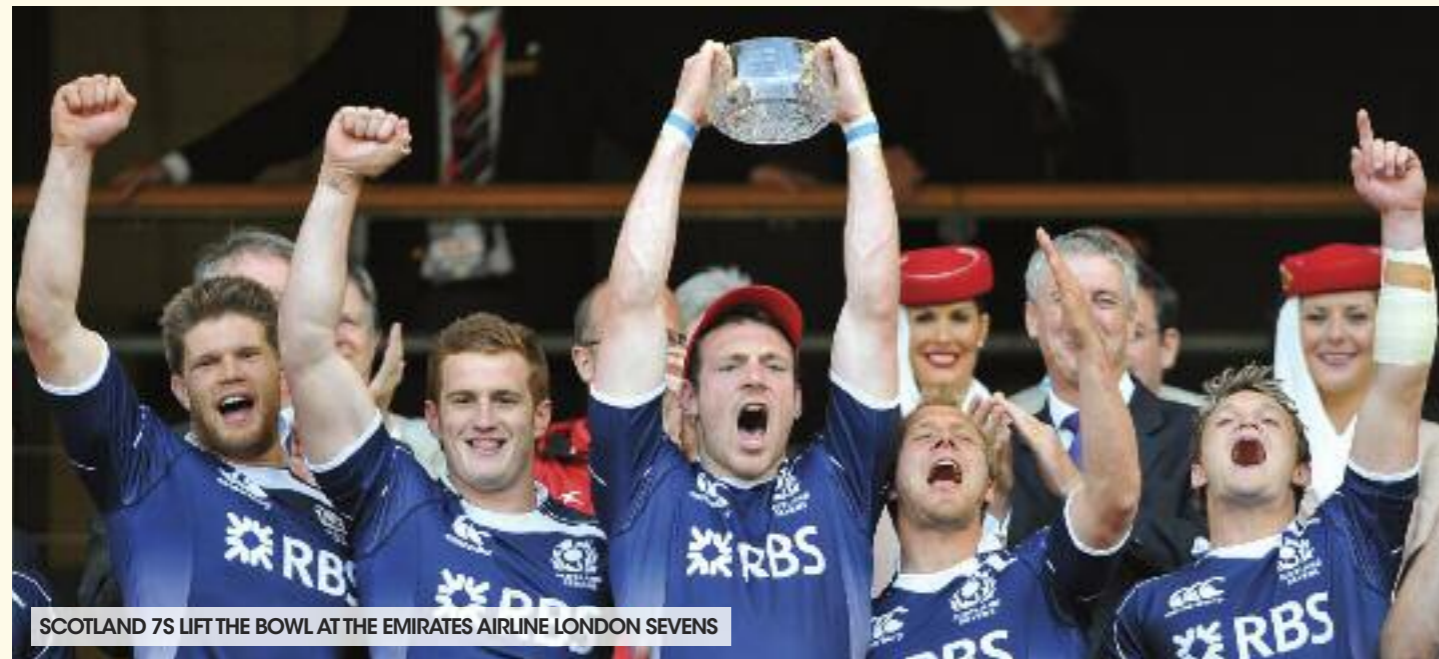
SCOTLAND 7S LIFT THE BOWL AT THE EMIRATES AIRLINE LONDON SEVENS

France Club International 30 – 18 Scotland Club XV (Orleans, 4 February 2011) Scotland Club XV 30 – 32 Ireland Club International (Netherdale, 11 March 2011)