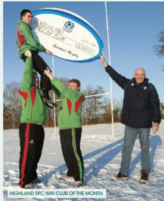
HIGHLAND RFC WIN CLUB OF THE MONTH