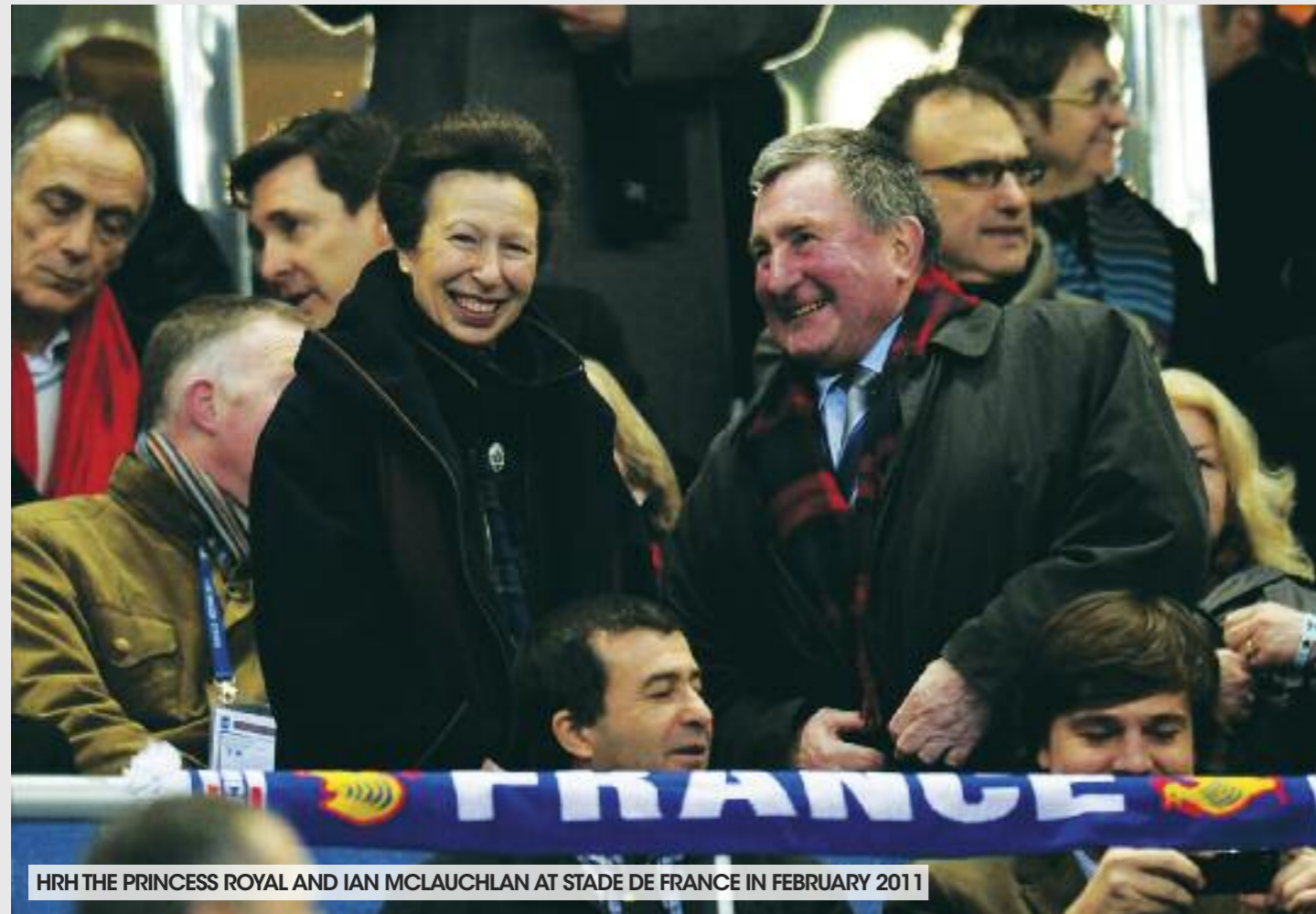
HRH THE PRINCESS ROYAL AND IAN MCLAUCHLAN AT STADE DE FRANCE IN FEBRUARY 2011