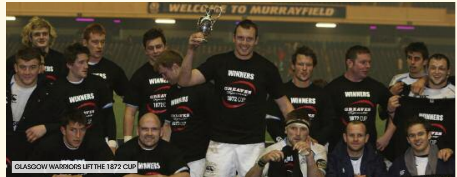
GLASGOW WARRIORS LIFT THE 1872 CUP