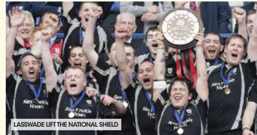
LASSWADE LIFT THE NATIONAL SHIELD

T - B: Melrose win the Premier 1 trophy; Hillhead / Jordanhill are presented with Women's Club of the Season; Ayr win the National Cup; Women's National Bowl winners Cartha Queens Park; Inductees and judges at Scottish Rugby's Hall of Fame. For more photos, see the inside back cover of this report.