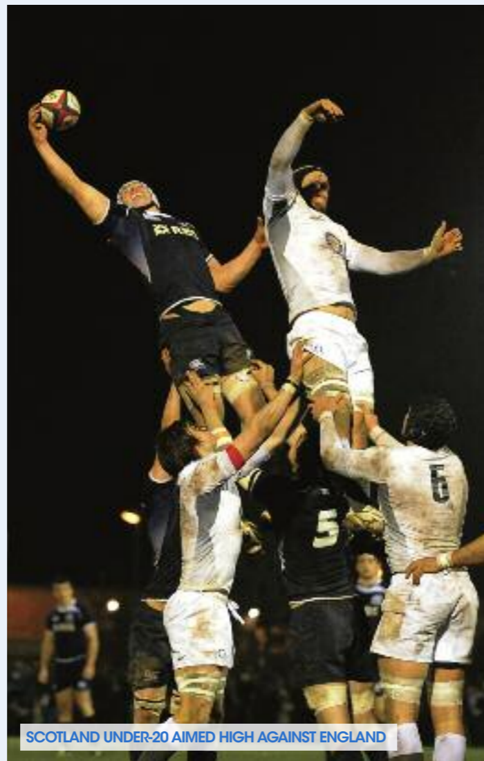
SCOTLAND UNDER-20 AIMED HIGH AGAINST ENGLAND

Players will now go forward for consideration into the under-18 programme.