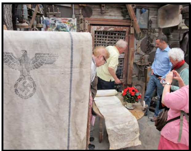
Nazi souvenir & Torah scroll