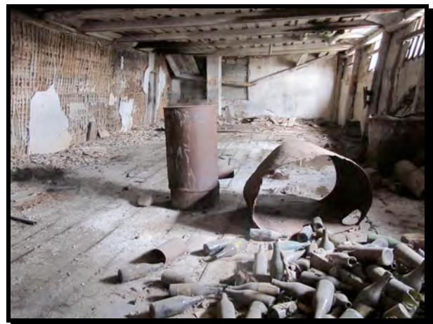
Remnants of old workshop