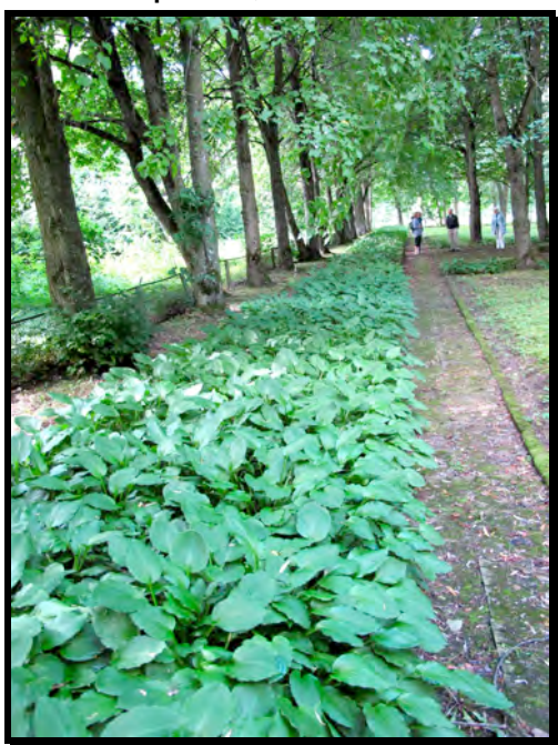
Execution pits, Naryshkin Park

On Friday morning, we went to the Jewish Genocide (translation from Lithuanian sign) site in Naryshkin Park. It's a ten minute walk from the town square. This is where the main massacre took place and where my great grandparents are buried. It remains a chilling and beautiful place. A U shape of dense, flowering shrubs mark the pits and mass graves. The surrounding tall trees filter light onto the memorial plinth, inscribed in Lithuanian and Yiddish.