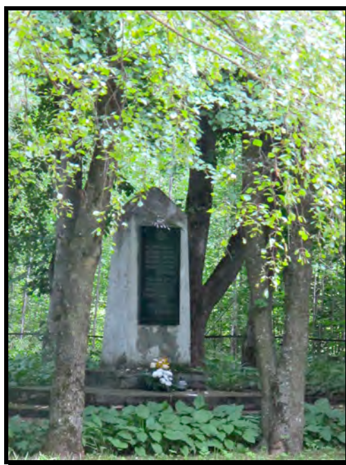
Memorial, Naryshkin Park