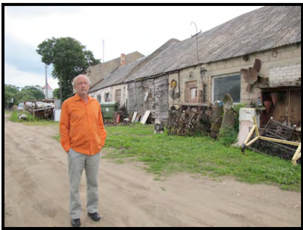
Rod at former Lemchen workshop

Afterwards, I walked to the Lemchen house, just down from the square. It looks much the same as in 1997 save for the tv satellite dish. But at the back, in the old wool-dyeing workshop, a local mechanic, woodworker and eccentric sculptor has moved in. Next day, Valdas got us inside. Upstairs in the crumbling attic, some vats that could've been used for dyes and another large cauldron outside that looks very old, were the only possible remnants of Avraham and Rachel's enterprise.