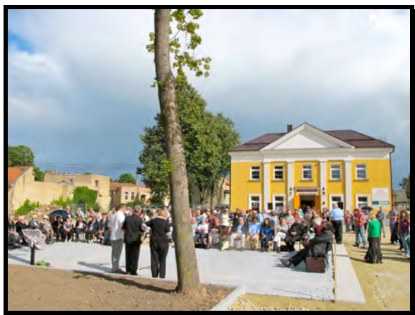
The town square & Cultural Centre