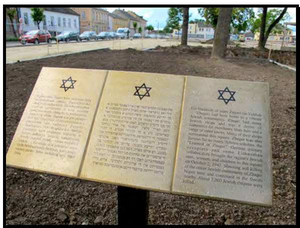
Lithuanian, Yiddish and English texts