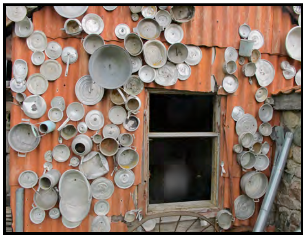
The pots & pans house