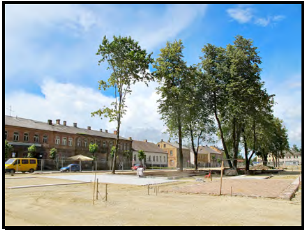
Site of memorial plaque, town square

For lunch, we had beers, borscht and blinis in the pub across from the town square and gathered in the late afternoon for the ceremony. Valdas was supervising the erection of the commemoration plaque which he'd picked up from Siauliai, the nearest big town, just the day before. The square is undergoing a total renovation, so a gang of workers were at it until an hour before, laying down new paving in the area of the plaque. The rest of square is still dirt. The weather was threatening one minute and sublime the next. As it turned out, during the hour and a quarter of the event, we had rotating bouts of sun and showers and a dramatic but brief downpour just before the end.