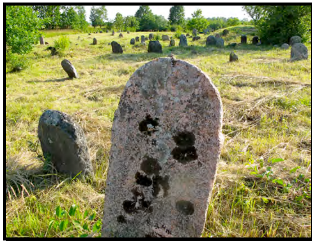
Jewish cemetery, Zagare