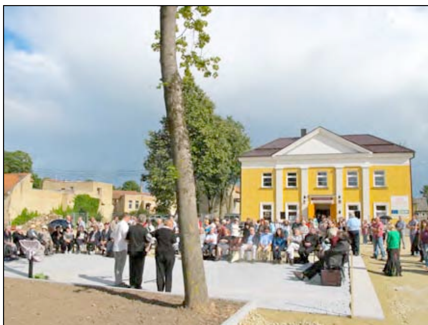
The Culture house in Zagare

The weather is unpredictable: midsummer showers alternate with shafts of sunlight breaking through threatening clouds. Will heavy rain will hold off until the plaque has been unveiled?