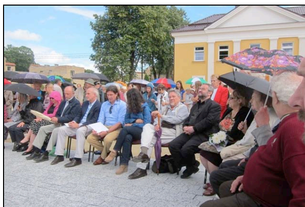
People in Zagare town square