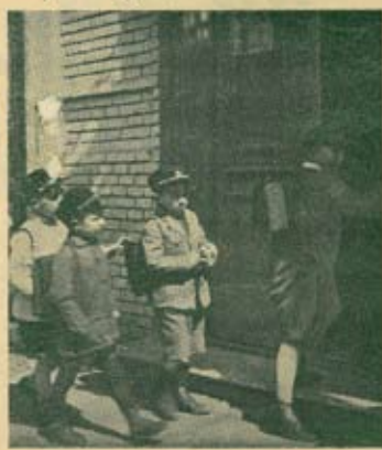
אין שול אריין.